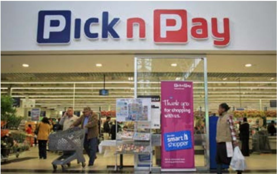
R7 billion in savings and shifting habits highlighted in Pick n Pay's 2025 Smart Shopper report.

shop as a deeply ingrained routine. The Pick n Pay store in Tembisa recorded the highest number of Smart Shopper swipes nationally, followed by Pick n Pay Promenade in Cape Town and Pick n Pay Hyper North in Durban. Convenience has also reshaped shopping habits through the integration of Pick n Pay asap! within the Smart Shopper app. The service recorded 1.7 million new installs and a 44% year-on-year increase in on-demand sales in the first half of the financial year. The platform maintained a 97% item availability rate, helping drive repeat usage. One Cape Town-based customer placed 327 asap! orders since January, with top users in Johannesburg and Durban placing 246 and 228 orders respectively. According to Pick n Pay, these figures highlight how on-demand shopping has become embedded in daily routines. The report identifies three dominant shopping missions among South Africans: Fresh Healthy Full Shop, Pantry Filling and Cleaning, and Sweets, Snacks and Groceries. Regional preferences remain distinct. Cape Town shoppers favour health-forward items such as free-range meats, avocados, and rice cakes, alongside local favourites like biltong and chutney. Johannesburg shoppers prioritise maize meal, beef, and chicken, with premium beer and