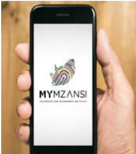
South Africa is preparing to phase out the green ID book as government moves towards a fully digital identity system.

to 2030, will expand the system across healthcare, education, and business services. Alongside this work, the Department of Home Affairs is implementing its "Home Affairs @ Home" strategy, which aims to expand access to smart ID and passport services through bank branches nationwide. Banks have committed to rolling out services to at least 153 branches by March 2026, with plans to reach 1,000 branches by 2029. Home Affairs is also working with banks to integrate ID services into banking apps and eventually deliver smart IDs directly to homes or offices, reducing congestion at Home Affairs offices. Despite progress, challenges remain. Schreiber has revealed that approximately 4.4 million South Africans over the age of 16 currently have no form of ID, while an estimated 16 million green ID books are still in circulation and must be replaced. Home Affairs has urged citizens who qualify for smart IDs to migrate as soon as possible, warning that digital identity systems will significantly reduce fraud while improving access to government services.