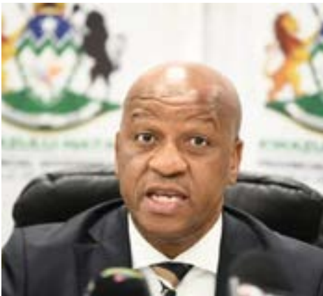
Fireworks and Fury: Ntuli Survives No-Confidence Vote after Chaotic Day in KZN Legislature.