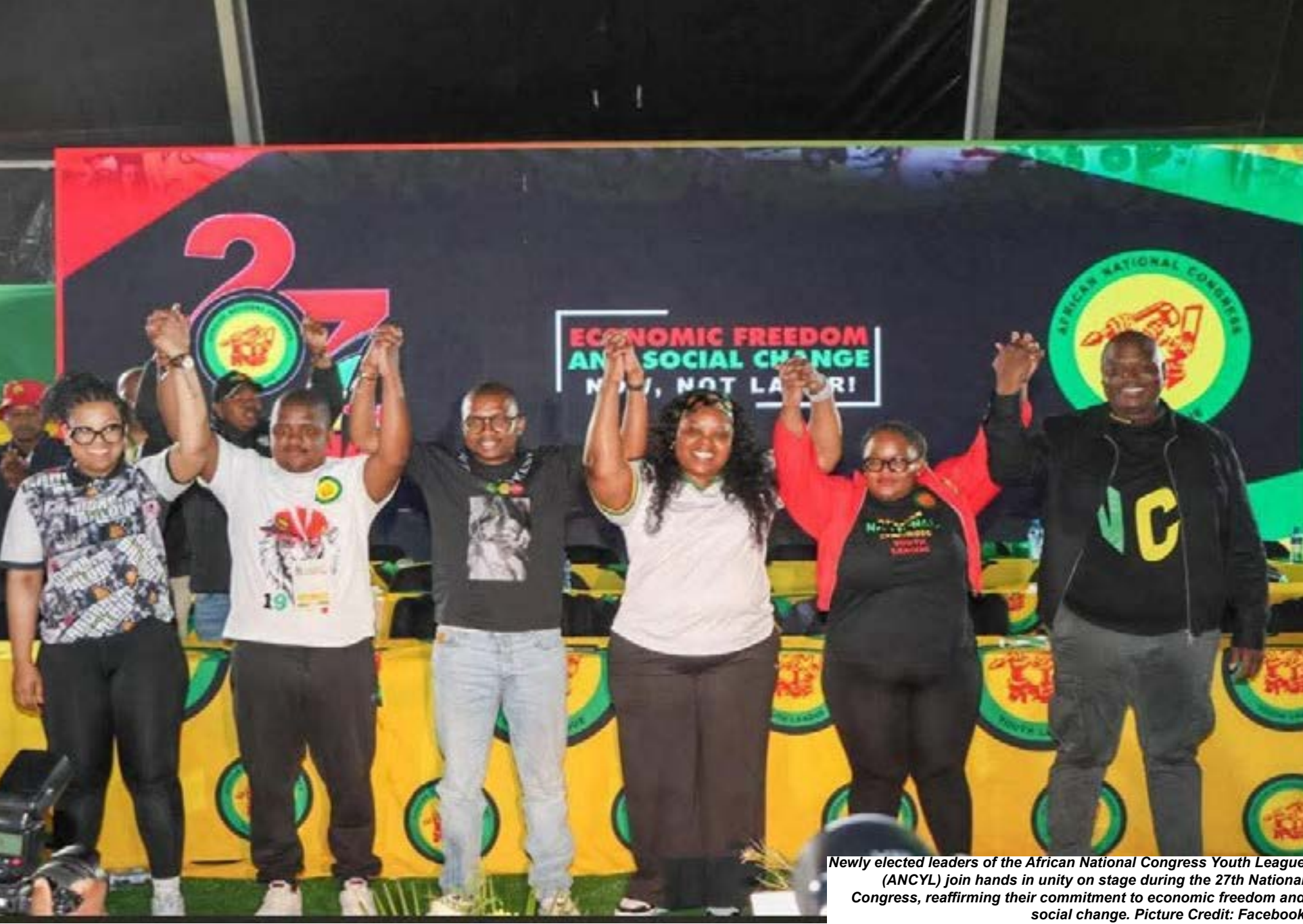
Newly elected leaders of the African National Congress Youth League (ANCYL) join hands in unity on stage during the 27th National Congress, reaffirming their commitment to economic freedom and social change.