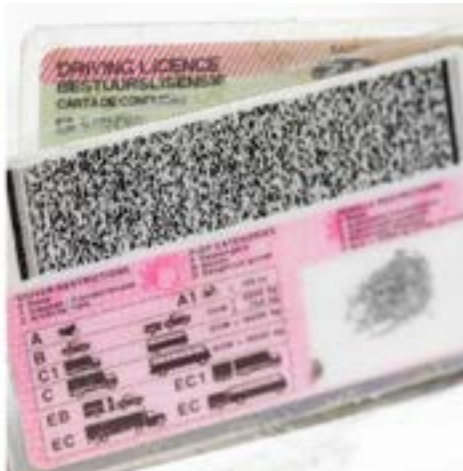
South Africa extends driving licence validity from five to eight years to ease backlogs and system strain.