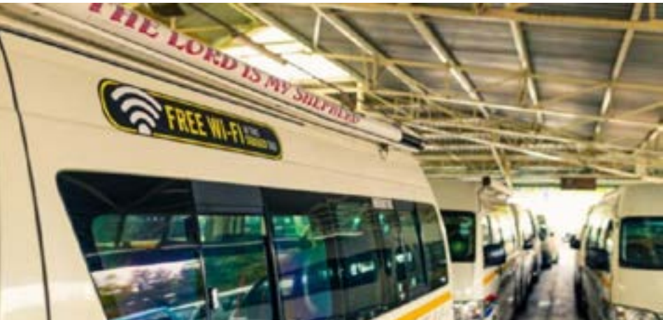
Taxi industry embraces connectivity and digital tools for the modern commuter.