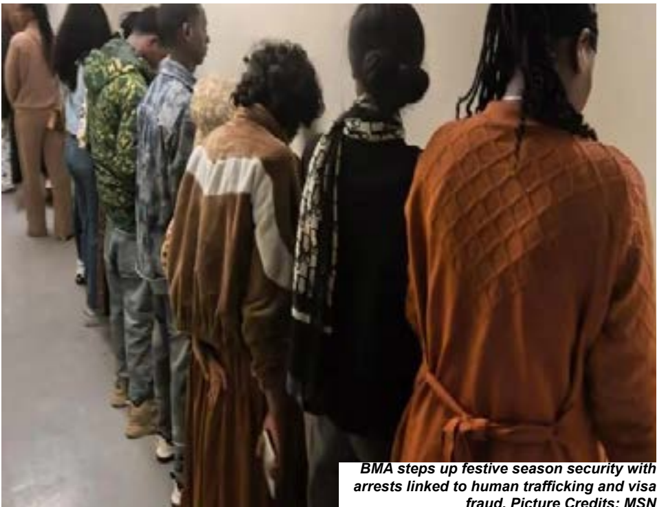
BMA steps up festive season security with arrests linked to human trafficking and visa fraud.