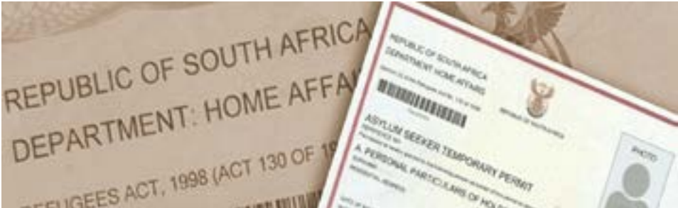
Home Affairs has released a draft White Paper proposing stricter asylum rules and a merit-based citizenship system. Public submissions are open until the end of January.