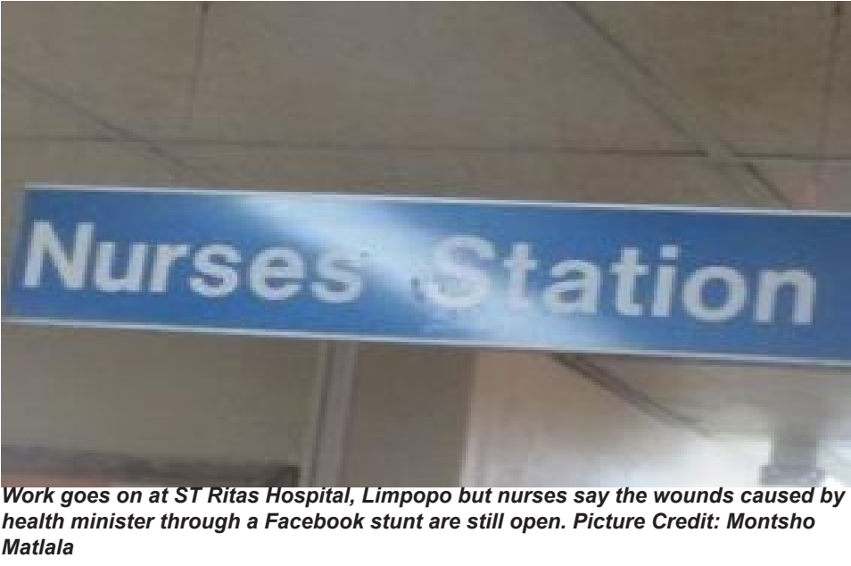
Work goes on at ST Ritas Hospital, Limpopo but nurses say the wounds caused by health minister through a Facebook stunt are still open.