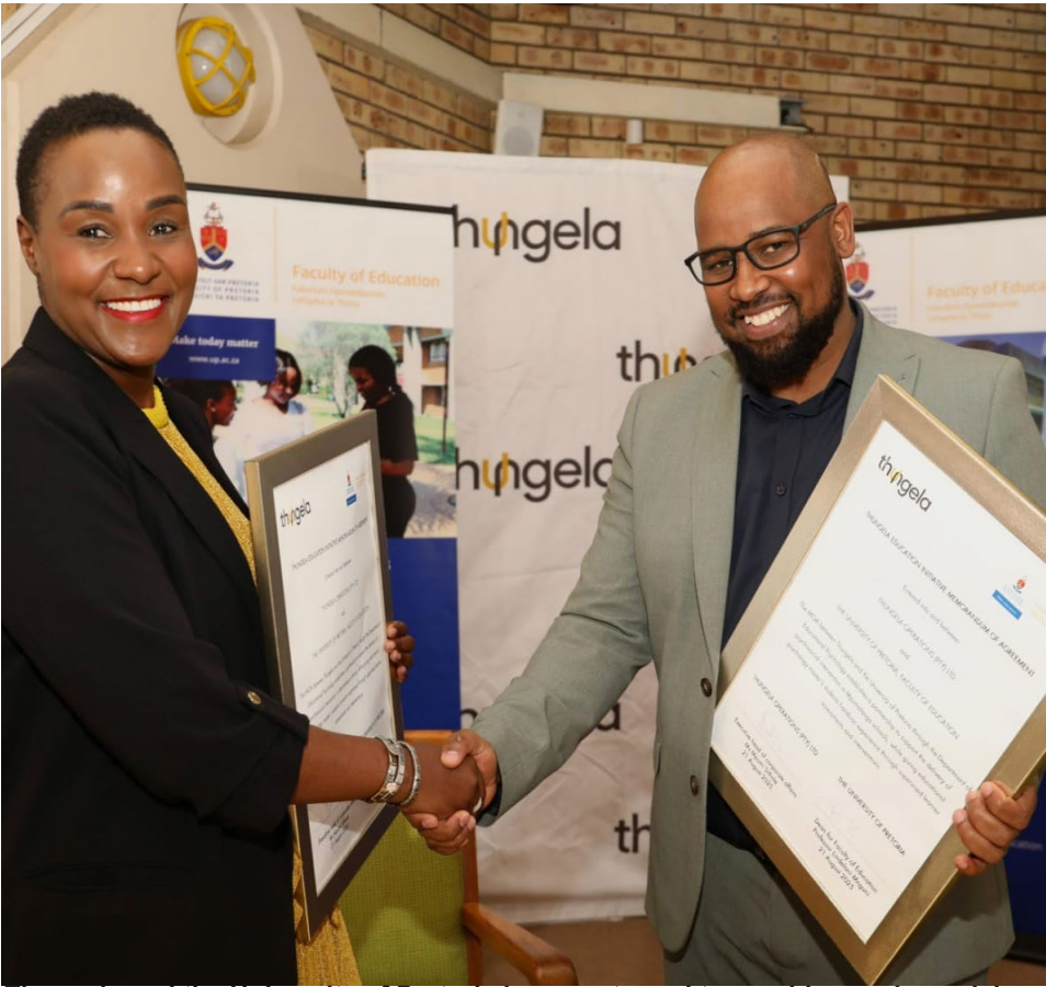
Thungela and the University of Pretoria have partnered to provide psychosocial support in Mpumalanga schools through the deployment of master's students, aiming to enhance educational outcomes and emotional well-being in no-fee schools.