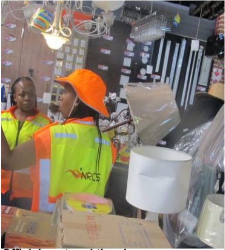
Officials entered the shops unannounced and after brief introductions start searching for targeted products.