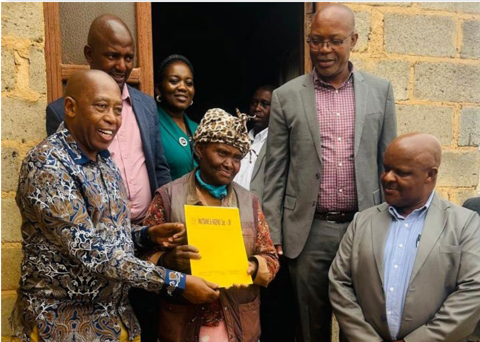
Progress at Amersfoort Wastewater Treatment Plant Nears Completion, Promising Improved Sanitation for 6,000 Households

Newly appointed deputy chief justice of South Africa Dunstan Mlambo