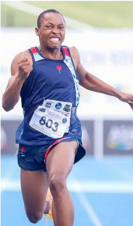
Walaza's future at the World Championships depends on medical clearance after injury concerns.