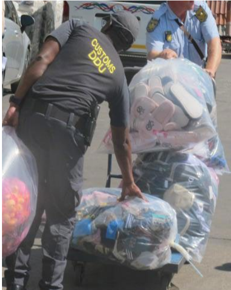
Goods found not in compliant with standards are confiscated and if unclaimed will be destroyed.