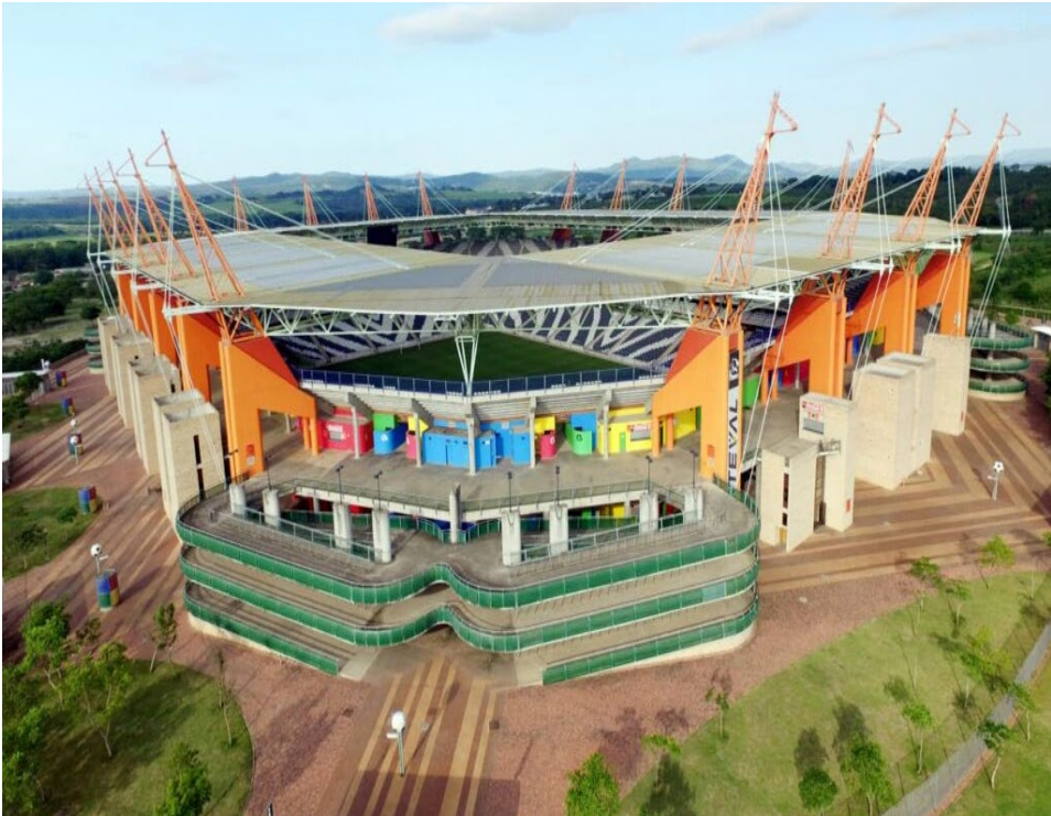
Mpumalanga gears up for the MTN8 final at Mbombela Stadium, aiming to boost tourism and local economic growth through the exciting football showdown.