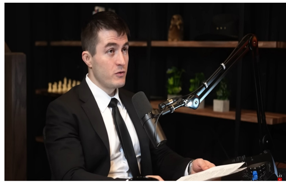
Lex Fridman, an American computer scientist and the host of "Lex Fridman podcast".

Yet, the "Lex Fridman Podcast" is more than just a source of information—it's a vibrant community of like-minded individuals united by a passion for exploration. Listeners are encouraged to engage through social media, forums, and live events, fostering meaningful discussions and connections beyond the podcast. In conclusion, the "Lex Fridman Podcast" offers a unique and enriching experience for those eager to expand their knowledge and explore the mysteries of the universe. So, if you're ready to embark on an intellectual journey of discovery, tune in and prepare to have your mind expanded in ways you never thought possible.