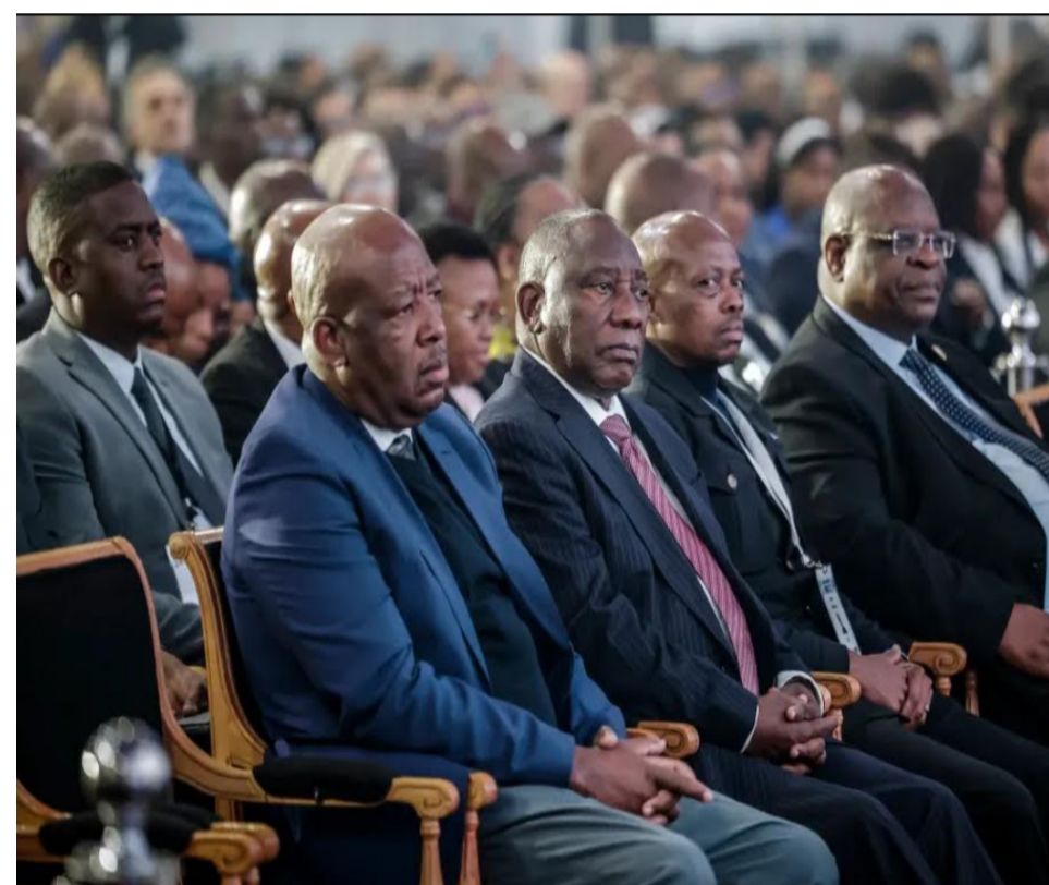
President of the African National Congress (ANC) and South African President Cyril Ramaphosa (C) attend the official announcement of the South African general election results in the Independent Electoral Commission (IEC) National Results Center at the Gallagher Convention Centre in Midrand, on June 2.