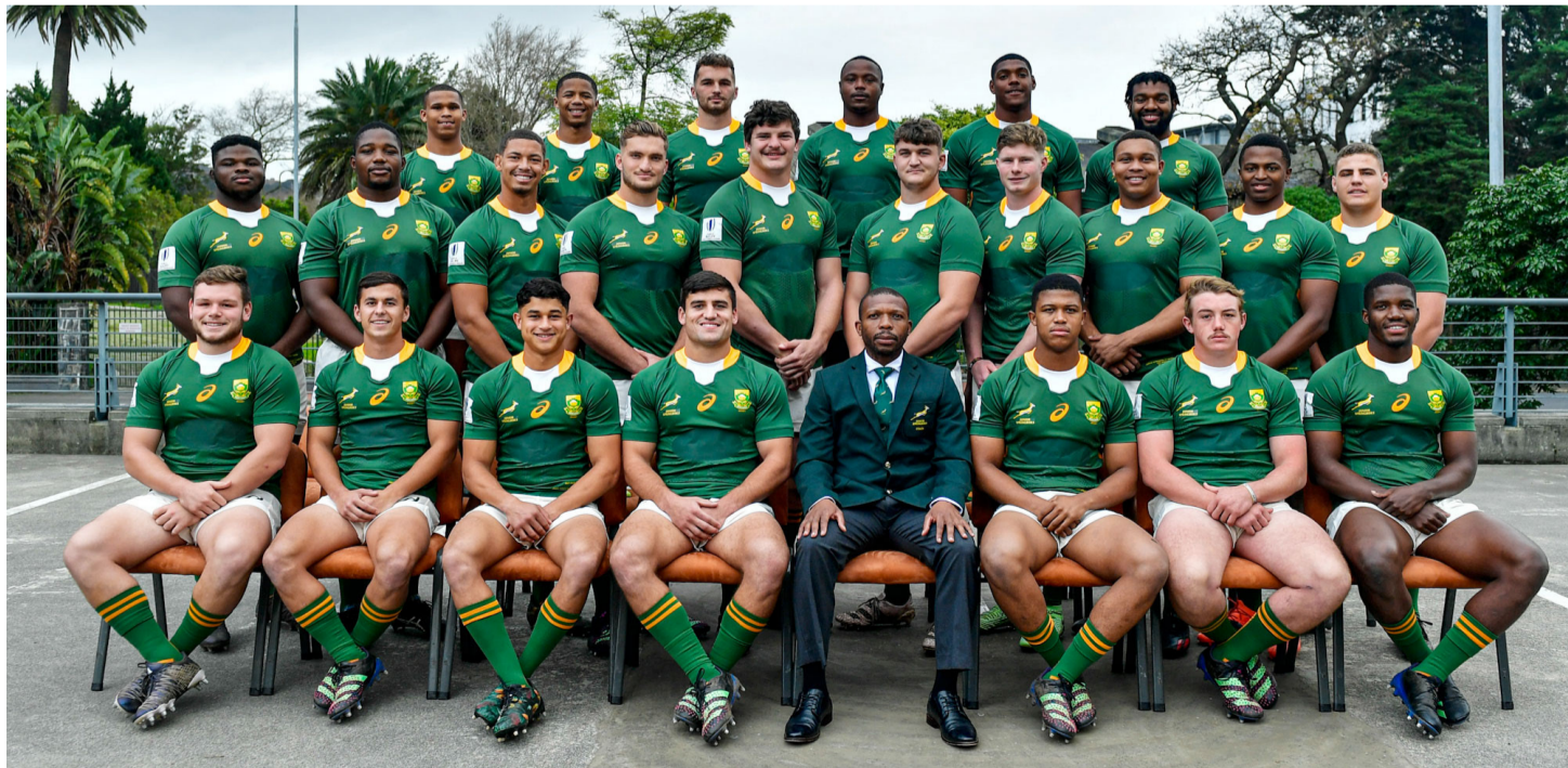
The Junior Springboks to face pool matches at the Under 20 Rugby World Cup.

Cape Town, South Africa - The Junior Springboks are gearing up to face off against England, Argentina, and Fiji in their pool matches at the upcoming Under-20 Rugby World Cup, set to take place in South Africa from June 29 to July 19. As the top 12 under-20 teams vie for global supremacy, defending champion France will be aiming to retain their title, while the Junior Boks are eager to build on their bronze medal performance from 2023. The tournament kicks off on June 29 at Cape Town Stadium and Athlone Stadium, with subsequent pool games scheduled for July 4 and 9. The final matches, including the semi-finals for the top four teams, will be held on July 14, followed by the finals and place games on July 19. These games will take place at Danie Craven Stadium in Stellenbosch, as well as at the stadiums in Athlone and Cape Town. Rian Oberholzer, South Africa's Rugby CEO, expressed excitement about hosting the tournament, highlighting its importance in promoting and growing the game globally. He emphasised the privilege of welcoming the next generation of rugby superstars and their supporters to South Africa. The 2024 U20 Championship will introduce