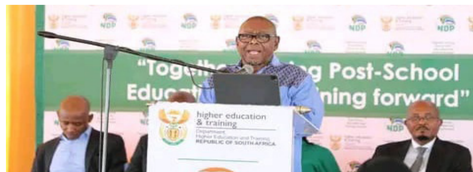
Minister of Higher Education and Training, Dr. Blade Nzimande, giving a speech at the official opening of Balfour Campus.