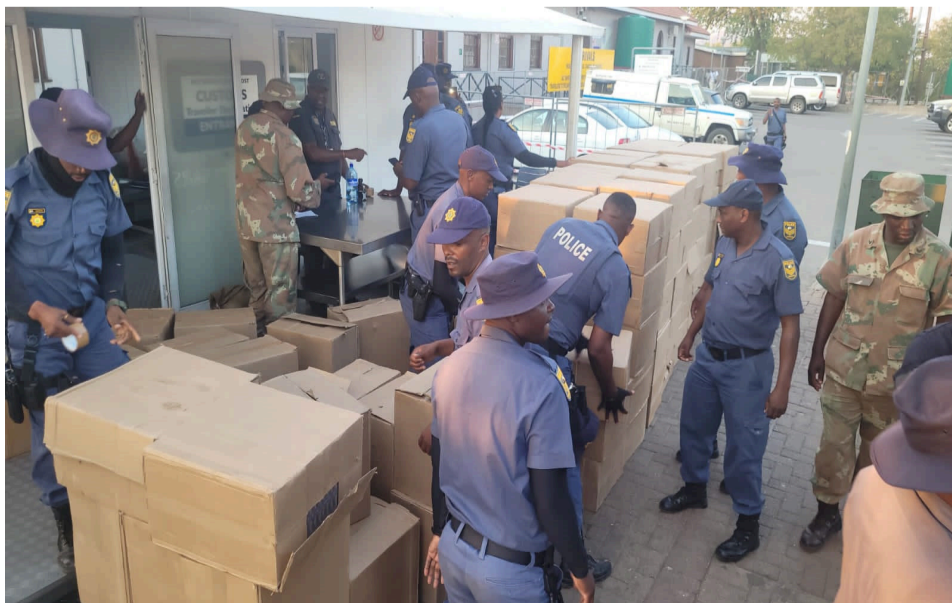
Millions of rands worth of illicit cigarettes and five tipper trucks recovered through high-density Operation Vala Umgodi 1.