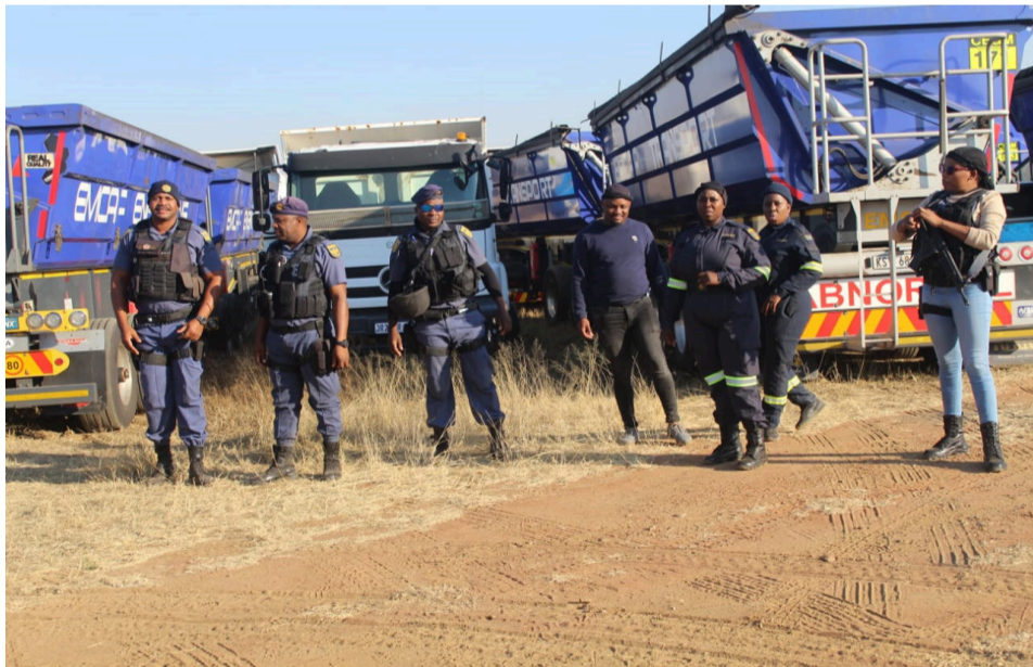
Police and soldiers conduct a thorough search of seized contraband boxes during Operation Vala Umgodi.

These suspects are scheduled to appear before various magistrate's courts this week. Operation Vala Umgodi underscores the efficacy of collaborative law enforcement efforts in combating illegal activities, showcasing the resolve of multi-agency operations in safeguarding communities and disrupting criminal networks.