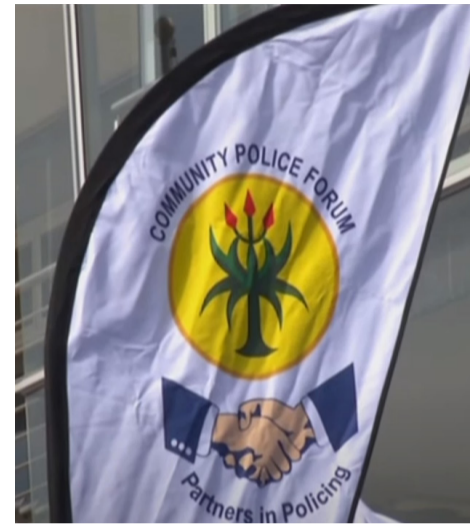
CPF Banner.

collaboration between law enforcement agencies and CPFs. "If the CPF does not have the resources, it's becoming more difficult for everyone to ensure that the community is safe," she stated. The commissioner also urged the private sector to contribute to community safety efforts, highlighting the collective responsibility of safeguarding communities. "The CPFs are the ones that are also trying to mobilise the communities in terms of the awareness campaigns that we are having," she emphasised. "So far, as the province, you will take note that we are confronted with crimes such as rape and murder." The provision of vehicles and resources to CPFs underscores the commitment to enhancing community safety and combating crime effectively through collaborative efforts between law enforcement agencies, CPFs, and the private sector.