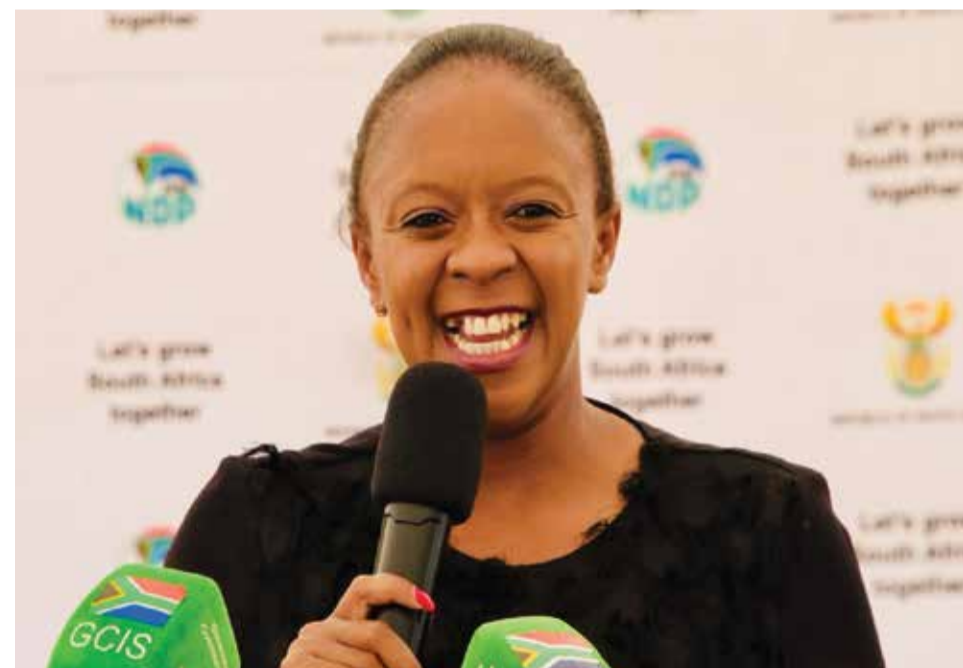
Deputy Minister Nomasonto Motaung addresses members of the public at Mmahlee Community Library.