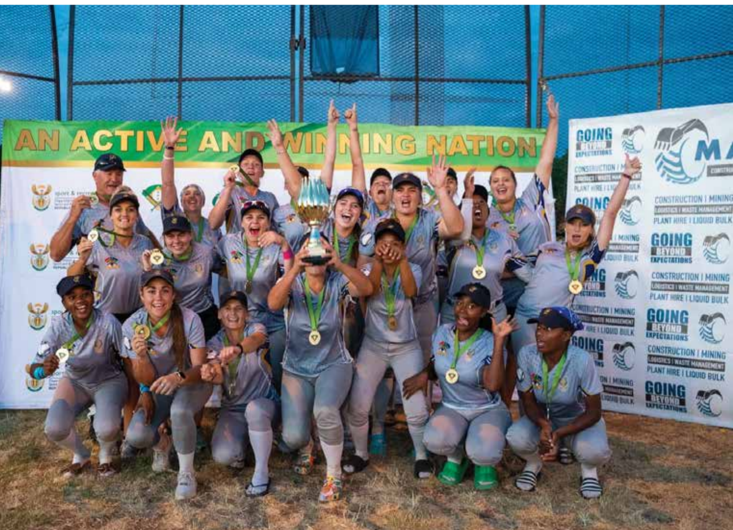
Limpopo women's team dominating their USSA counterparts with a commanding 11-1 victory.