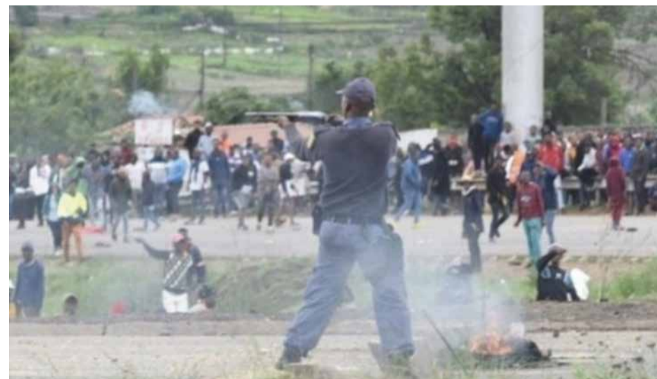
Police dispersing community during protests.

those who are found guilty are sentenced."