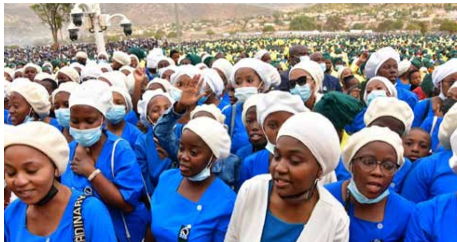
Members of the ZCC at St. Engenas in Moria, Limpopo during Easter Sunday.