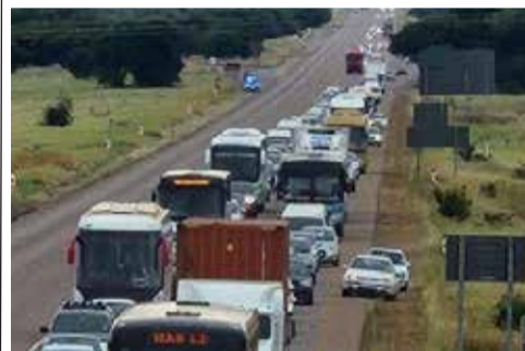
Heavy Traffic On Easter Monday On Limpopo Roads Including N1.