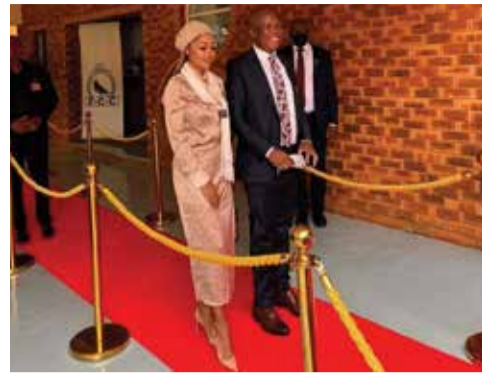
Julius Malema with his wife at St. Engenas ZCC in Moria, Limpopo, for Easter Sunday.