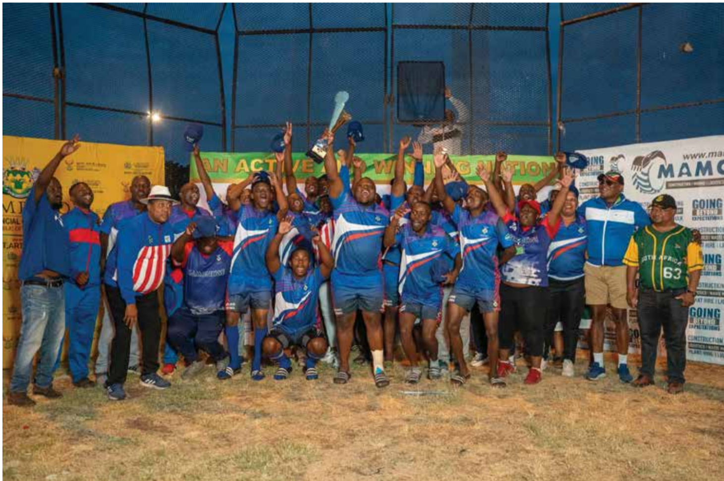
Limpopo men's team showcased their prowess, securing a resounding 21-0 win over North West.

Players bring memories of intense competition, enduring friendships, and the enduring legacy of another triumphant tournament organised by the Limpopo Softball Association with them when they return to their home regions.