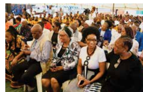
Members of the public who attended the book donation ceremony in Pudiakgopa village in Limpopo.

The SAPS remains committed to ensuring the safety and security of all residents in Limpopo and will continue to take proactive measures to prevent any potential threats to public order and safety.