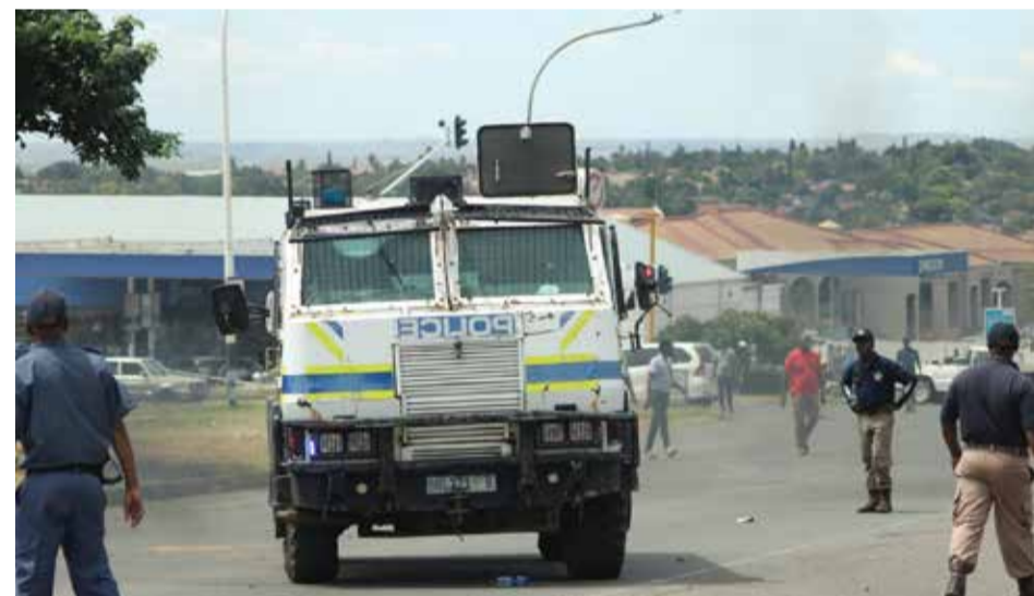
Police dispersing community during protests.

Shuping concluded by stating, "There is no such thing as justice failing because