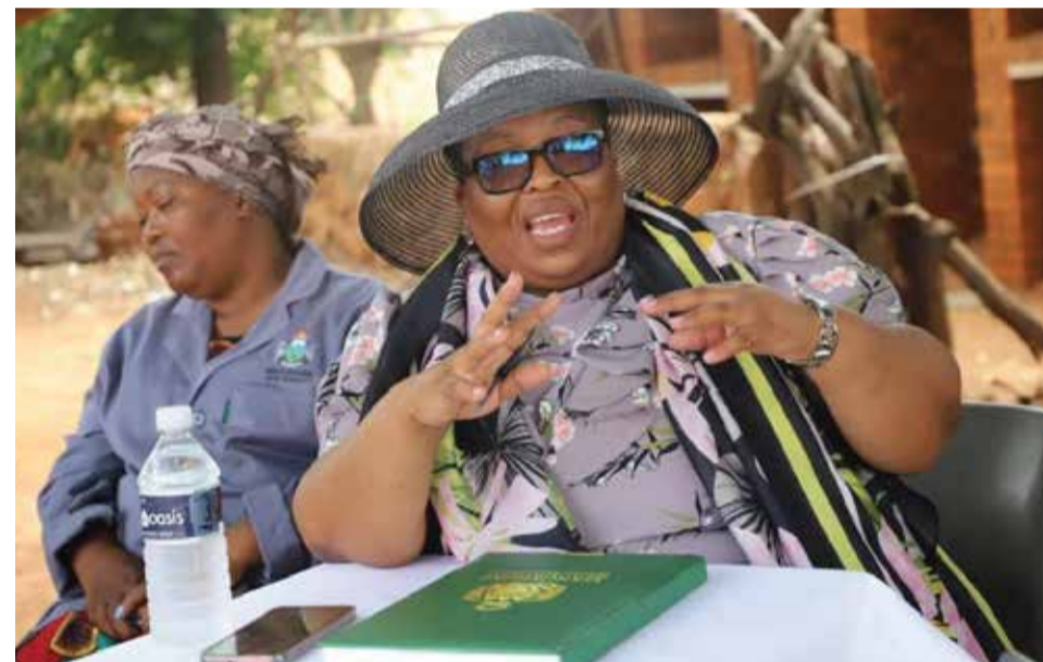
The Executive Mayor of Sekhukhune District Municipality, Cllr Minah Bahula having a lighter moment on her visit at Ga-Phaahla Traditional Authority outside Jane Furse.

Limpopo - The Executive Mayor of Sekhukhune District Municipality, Cllr Minah Bahula, led a delegation of council members in a constructive meeting with the council of the Phaahla Traditional Authority at Ga Phaahla village.