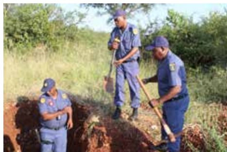
Police seizing various mining equipment utilized in the illicit mining activities.

Such operations serve as a deterrent to would-be offenders and reinforce the importance of law enforcement in safeguarding communities and natural resources.