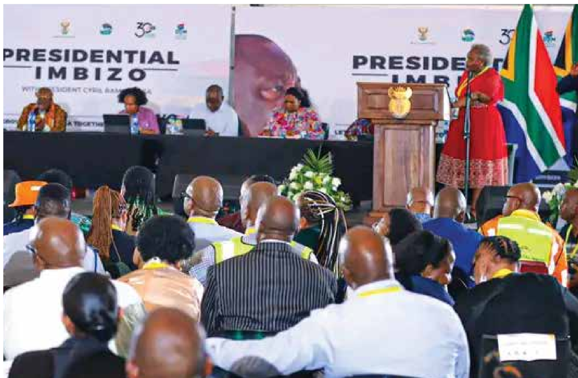
Emalahleni Residents attending Presidential Imbizo addressed by President Cyril Ramaphosa at Sy Mthimunye Stadium in Ackerville.

Mpumalanga - In a pivotal moment for the Emalahleni community in Mpumalanga Province, President Cyril Ramaphosa led a significant community engagement event aimed at addressing critical development challenges.