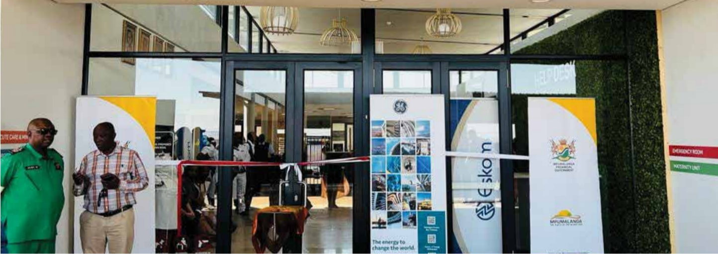
New state-of-the-art primary healthcare clinic to meet growing health demands in Botleng Extension 6.