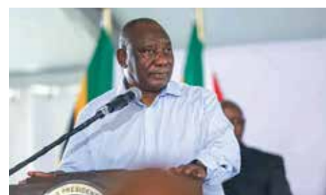
President Ramaphosa addressing community at Imbizo

President Ramaphosa's leadership in spearheading such engagements underscores the government's dedication to fostering inclusive growth and development, ensuring that no community is left behind in South Africa's journey towards prosperity.