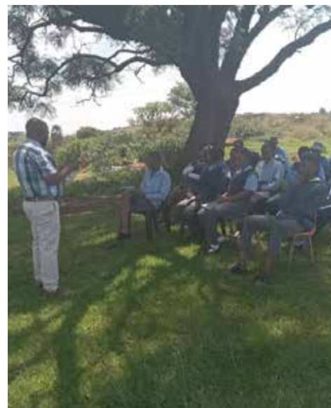
Matriculants at Sango still learning under trees.

raised by the DA and the governing body.