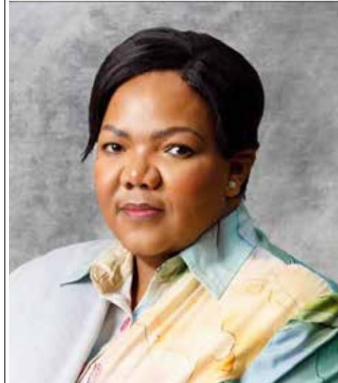
MEC for Finance, Economic Development, and Tourism, Nompumelelo Hlophe.

South Africa - Mpumalanga's Provincial Government unveiled its 2024/25 budget on Tuesday, March 12, 2024, at the Provincial Legislature. MEC for Finance, Economic Development, and Tourism, Nompumelelo Hlophe, presented a budget prioritising social services, economic development, and job creation.