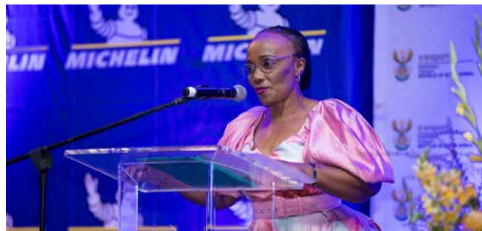
The Minister of Transport, Ms. Sindisiwe Chikunga, hosted over 220 truck drivers at the first ever Truck Driver Safety and Wellness Symposium held in Boksburg on 6 and 7 March.

South Africa - The Minister of Transport, Ms. Sindisiwe Chikunga, spearheaded a pioneering initiative to address the holistic well-being of South Africa's truck drivers.