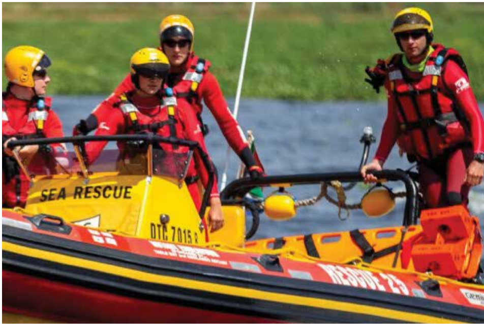
Station-25-Hartbeespoort-Dam-02 supplied NSRI divers at Hartbeespoort Dam.

Hartbeespoort Dam - In a tragic turn of events at Hartbeespoort Dam on Saturday, the body of a 40-year-old man who went missing after falling from a boat has been recovered.