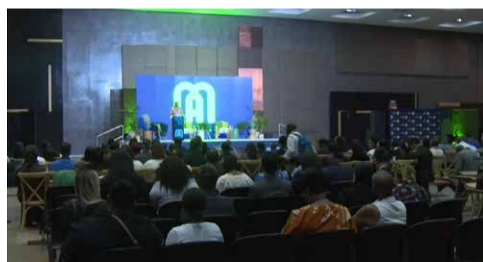
Day 1 at Meetings Africa.