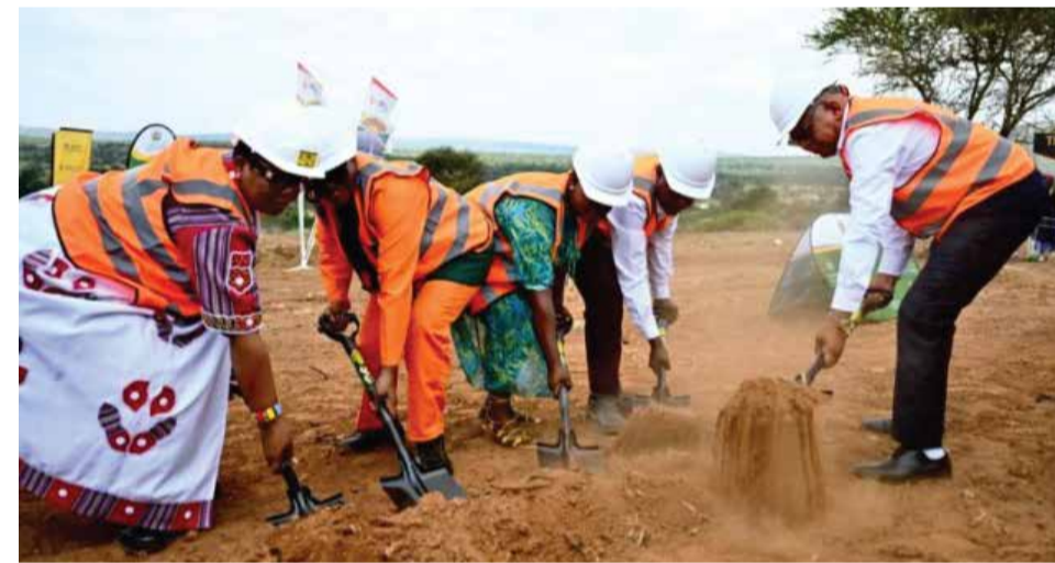
Building of R300m theater kicks off.

Limpopo - A new era for Limpopo's vibrant arts scene has begun with the official commencement of construction for the Limpopo Provincial Theatre.