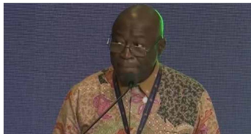
Mr Fish Mahlalela Deputy Minister of Tourism at Meetings Africa.