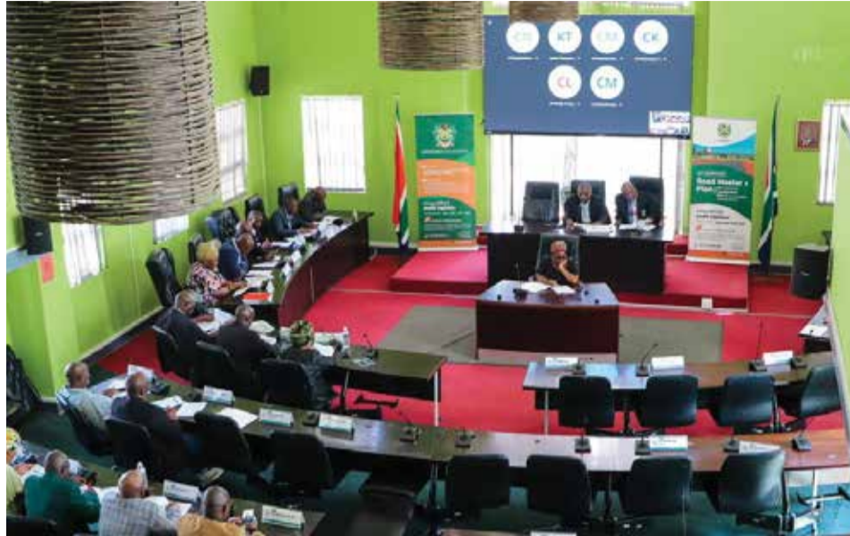
Makhuduthamaga Municipal Council.

Limpopo - In a decisive move aimed at bolstering its administrative capabilities and enhancing service delivery, the Makhuduthamaga Municipal Council announced the appointment of two seasoned professionals during a Special Council Meeting held Monday, March 4, 2024.