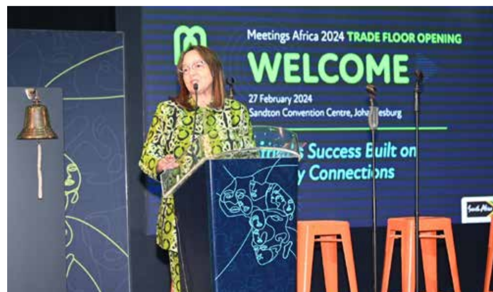
Minister Patricia de Lille presenting at Meetings Africa.

Limpopo - The Limpopo Tourism Agency (LTA) made a splash at Meetings Africa 2024, a major tourism event held at the Sandton International Convention Centre from February 26th to 28th, 2024.