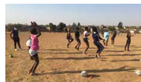
Girls Rugby Practice.

As Sekhukhune United prepares for their final group stage fixture against Diabes Noirs away from home on Sunday, March 3, 2024, they will be hoping to salvage some pride and end their campaign on a positive note. Despite the disappointment of their early exit from the competition, Sekhukhune remains determined to bounce back stronger in future competitions.