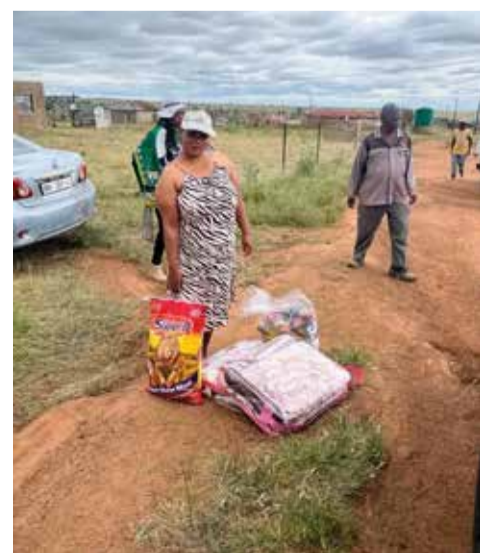
Elias Motsoaledi resident whose house was damaged by rain.

This task force will focus on restoring essential services and infrastructure while also providing support to the affected community.