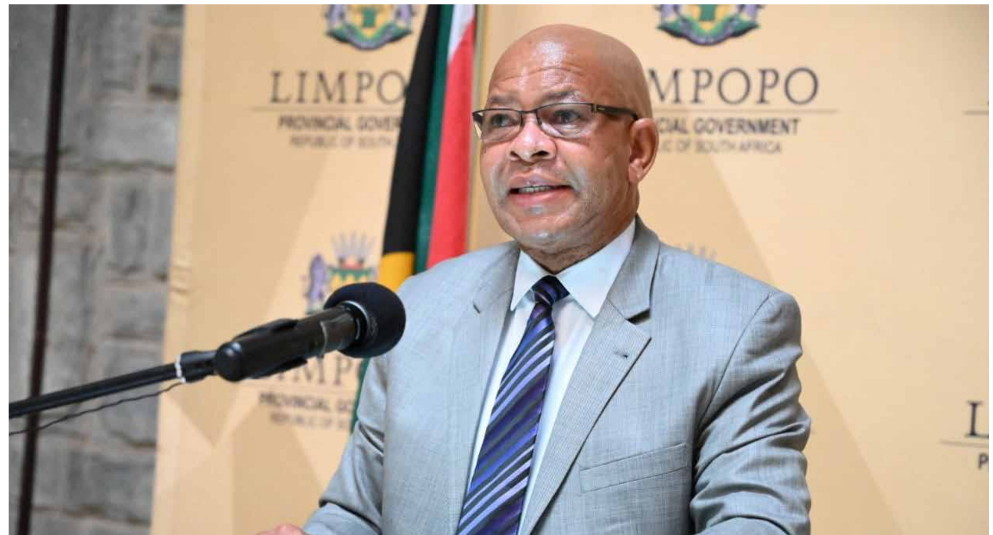
Limpopo Premier Stan Mathabatha.

Limpopo - Limpopo's State of the Province Address (Sopa) on Friday, was a story of two halves.