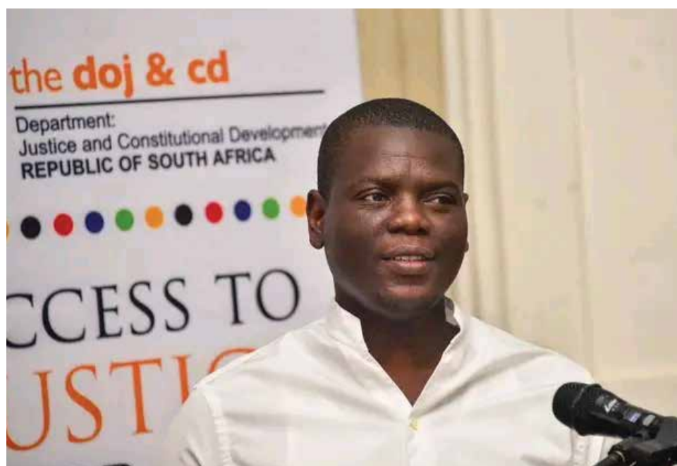
Minister of Justice and Correctional Services, Ronald Lamola at the 2024 Human Rights Month Launch at Kgosi Mampuru.

By acknowledging the struggles of the past and celebrating the progress made, South Africa can continue shaping a future where human rights are the cornerstone of a more just and equitable society.