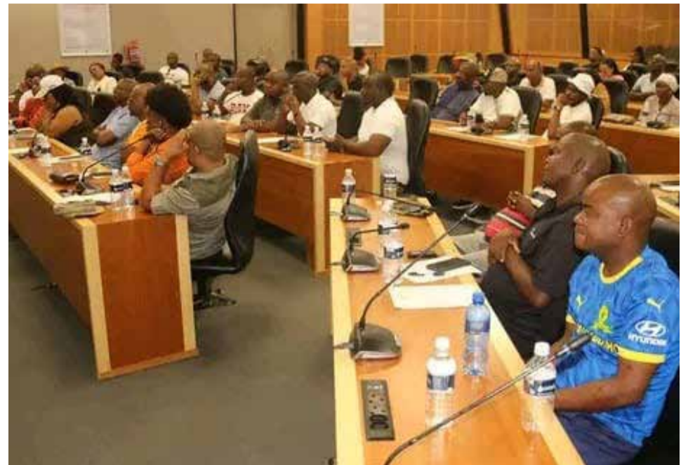
Delegates being addressed by Mayor at the Sekhukhune headquarters Council Chamber.