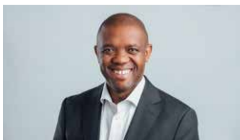
Leader of Rise Mzansi Songezo Zibi.

SOUTH AFRICA - In a stark indictment of the current administration, RISE Mzansi has raised alarm over the worsening rolling blackouts plaguing South Africa, culminating in the unprecedented escalation to Stage 6 shortly after President Ramaphosa's State of the Nation Address on February 9, 2024. The organisation asserts that these