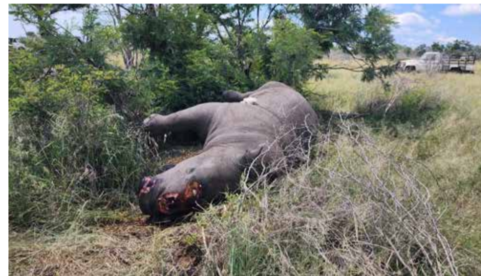
Two Rhinos Poached in Limpopo, Prompting Intense Manhunt for Perpetrators Picture: Supplied.

LIMPOPO - In a devastating blow to wildlife conservation efforts, two rhinoceroses fell victim to poaching at a local game reserve near Thabazimbi in Limpopo, South Africa, sparking an urgent manhunt by authorities to apprehend the perpetrators responsible for this heinous act.