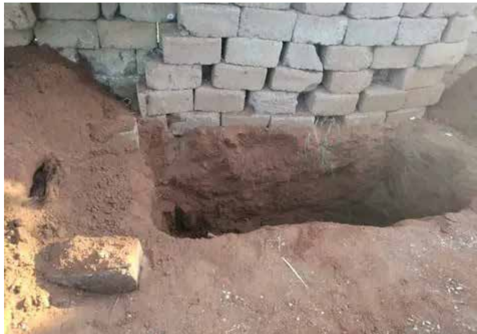
Two lifeless bodies of couple in the same yard at Ga-Marishane.

LIMPOPO - Police in the small town of Nebo, located in the Sekhukhune district, have launched a harrowing murder investigation and inquest after the grisly discovery of decomposed bodies belonging to a 38-year-old African male and a 34-year-old woman at their residence in the Ga-Marishane Dihlaganeng section.