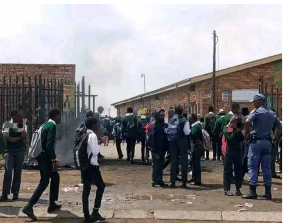
Chief Ampie Mayisa Secondary School learners staged a sit-in outside the school on Monday.

MPUMALANGA - Tensions flared at Chief Ampie Mayisa Secondary School on Monday, February 19, 2024, as learners staged a sit-in outside the premises, decrying what they perceived as the school's involvement in witchcraft and satanic rituals.