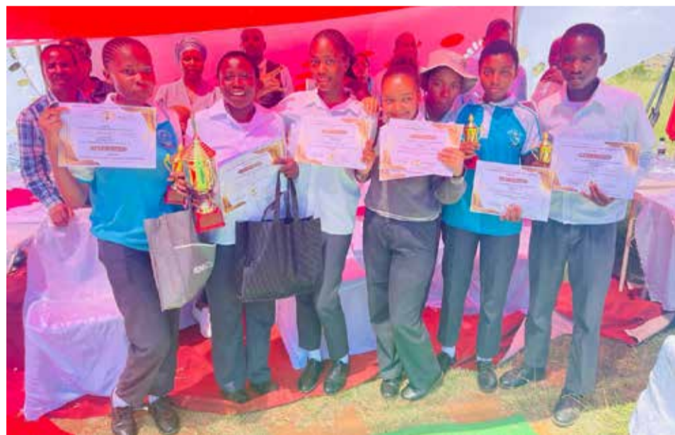
Some of the best performers across all grades flaunting their accolades in jubilation during the awards ceremony in Matsebong Secondary School.

DICHOUENG, LIMPOPO - On Friday, February 16, 2024, the Timeless News Foundation held a glittering ceremony at Matsebong Secondary School to recognise and celebrate the outstanding achievements of its students.