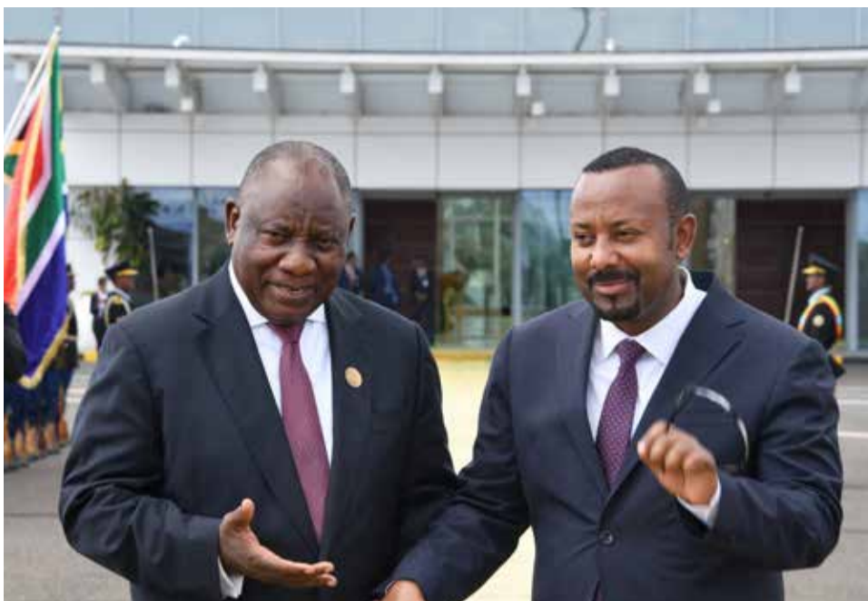
President Ramaphosa departs Ethiopia after AU summit.

Pretoria - President Cyril Ramaphosa concluded his participation in the 37th African Union (AU) Summit on Sunday, February 18, 2024, where the future of education, regional security, and pandemic preparedness took centre stage.