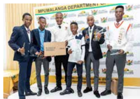
Students receive tech support and awards.

DELMAS, MPUMALANGA - Recognising education's transformative power, Glencore Coal is actively empowering South African youth through technology and resources.