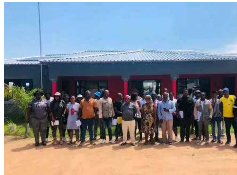
The Vuligqondo Innovation Networking Platform sponsored the registration of 20 new Poultry Farming Businesses towards achieving Poultry Production Value Chain System, Food Security and Poverty Alleviat.

MPUMALANGA - The Dr. JS Moroka Poultry Farmers Association in Mpumalanga is celebrating a significant step towards food security and poverty alleviation in rural communities with the launch of their innovative poultry farming initiative at the Vuligqondo Digital Lab.