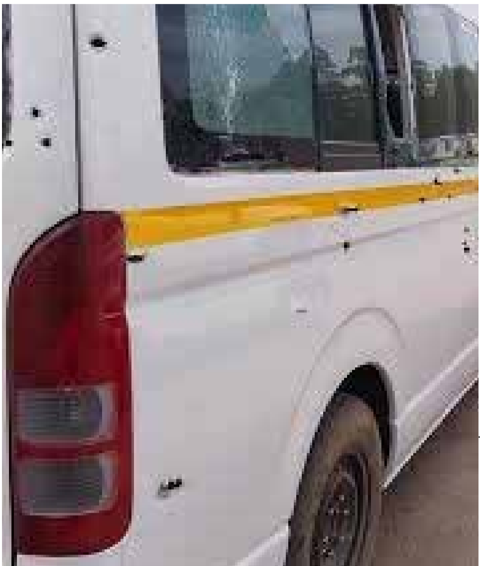
Fatal Shooting in Sabie, Taxi Driver Injured in Kriel.

MBOMBELA - The tranquil town of Sabie was rocked by tragedy last Tuesday, February 13th, 2024, as a man fell victim to a fatal shooting incident.