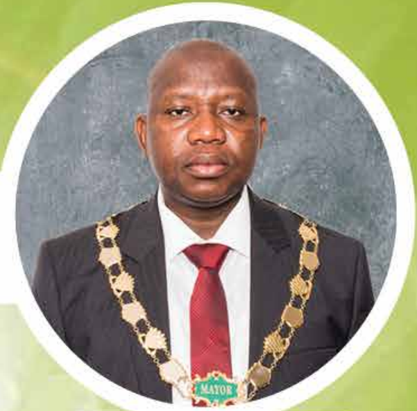
Honourable Mayor Cllr Given Marasekeng Moimana