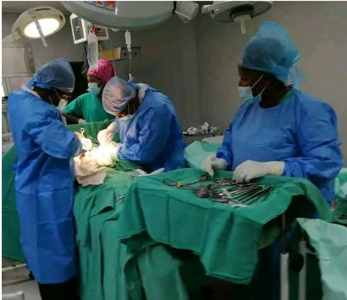
Rural Health Matters specialists performing operations in Jane Furse Hospital to reduce surgical backlogs.