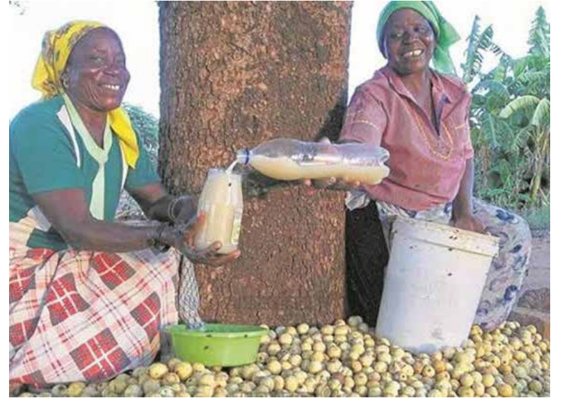
Limpopo is ready to host Marula Festival 2023.