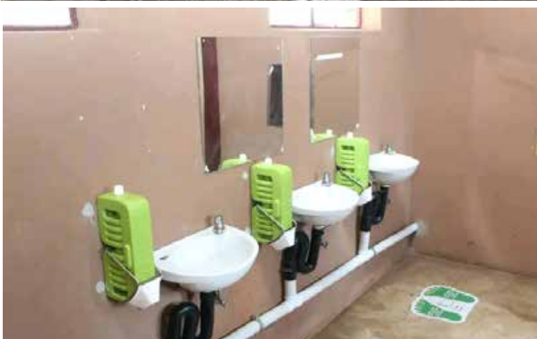
The LDoE says it has started rolling-out of schools' water and sanitation infrastructure to get rid of pit latrines at various schools in the province.