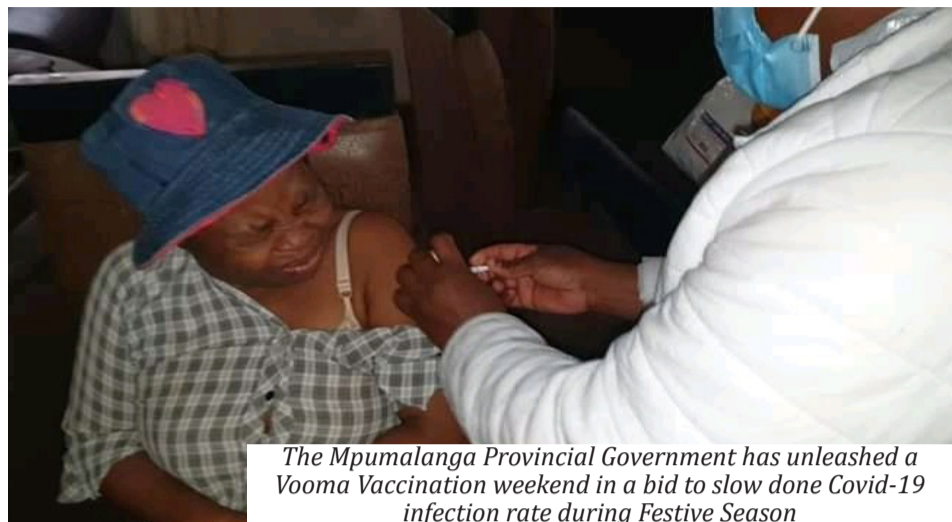
The Mpumalanga Provincial Government has unleashed a Vooma Vaccination weekend in a bid to slow down Covid-19 infection rate during Festive Season