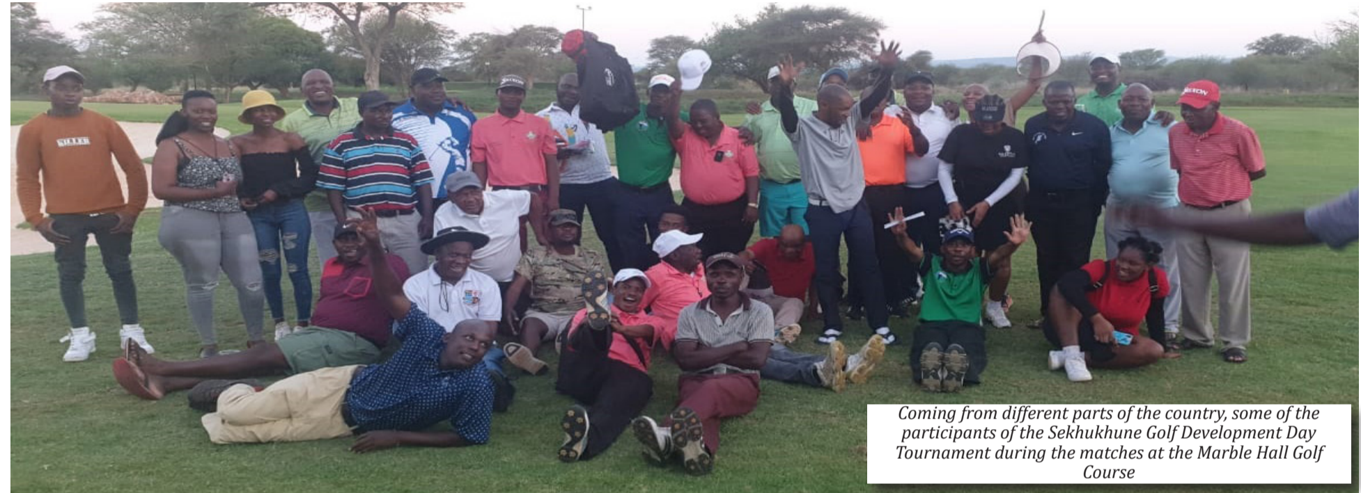
Coming from different parts of the country, some of the participants of the Sekhukhune Golf Development Day Tournament during the matches at the Marble Hall Golf Course