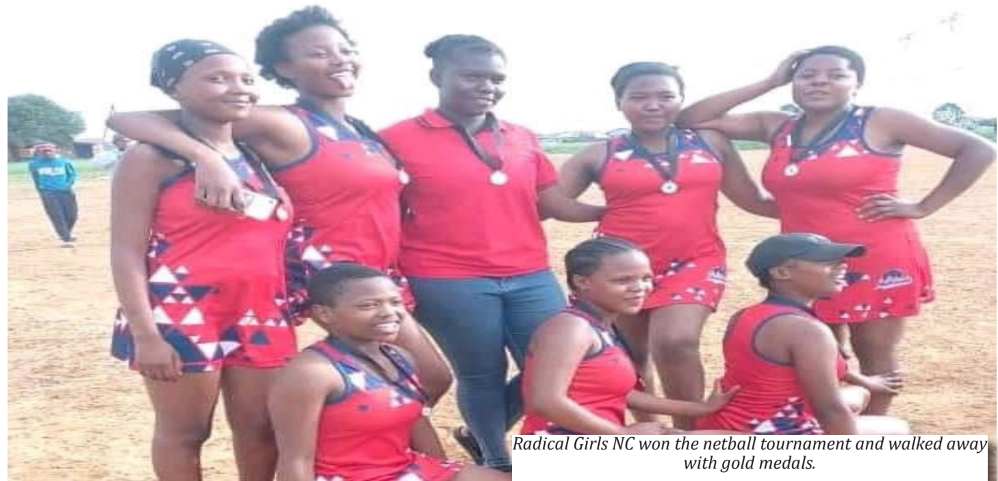
Radical Girls NC won the netball tournament and walked away with gold medals.

MIDDLEBURG: To fight the scourge of Gender Based Violence (GBV) perpetuated to the public, the Steve Tshwete Local Municipality (STLM) Youth Development Office, organized a sporting event, aiming to spread the awareness to tackle gender based violence in the communities. The sporting event was organized under the theme: "Orange the World: End Violence against Women Now", and has taken place at Mhluzi Extension 8 Sports Grounds. The sporting event was held in partnership with Multiracial Youth Centre from Nasaret, Khuthala Youth Development from Rockdale and the Tseladimatlapa Youth Centre from Doornkop. Activities for the day included football, netball and indigenous games such as diketo, morabaraba and ncuva. Football teams that participated in the tournament included, Mission United FC from Rockdale, Inyimbha United FC from Mhluzi Extension 24, Charmer Boys FC from Mhluzi Extension 24 and Middelburg City FC from Mhluzi Extension 24. The netball teams taken part in the tournament were Future Stars NC, Radical Girls NC, Mhluzi Young Fighters NC and Shooting Stars NC. According to STLM, the purpose of the tournament was aimed at spreading awareness against gender-based violence and celebrating 16 Days