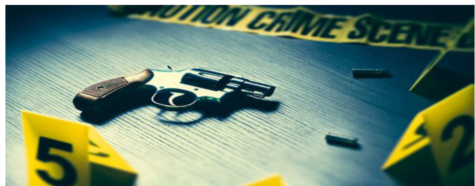
The police in Mpumalanga have launched a manhunt after a businesswoman was murdered in cold blood at Maphotla Village outside Siyabuswa