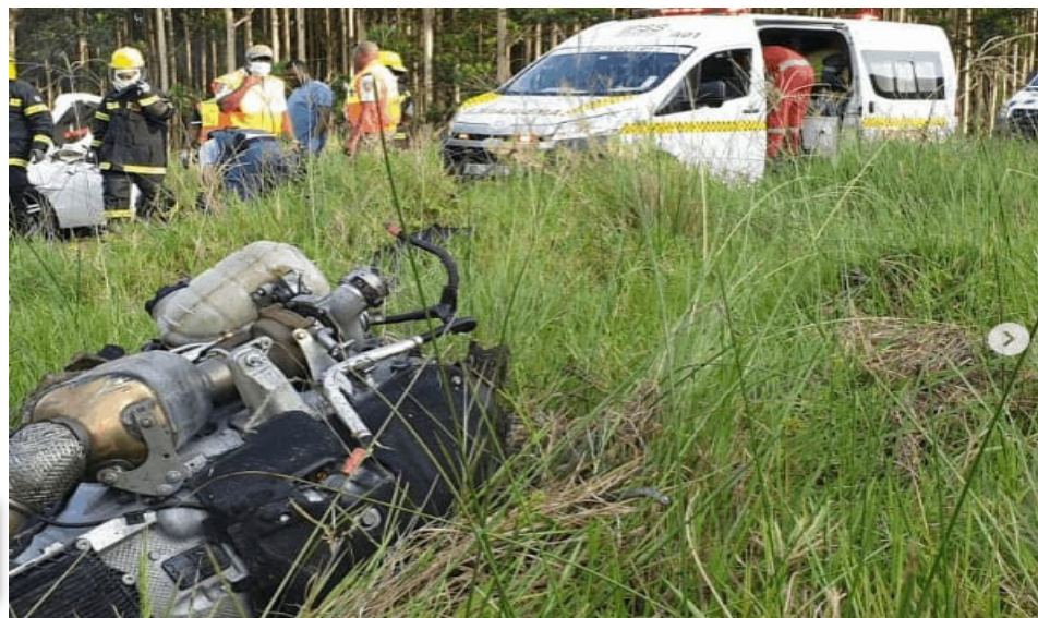
Four people lost their lives in a fatal car crash between eMalahleni and Verena