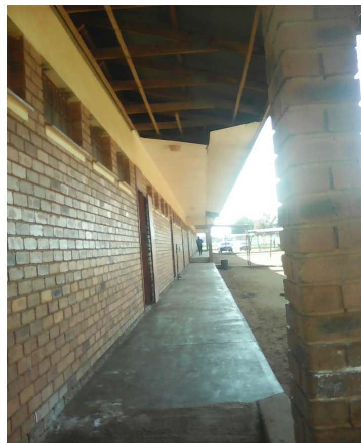
The collapsing Embokodweni Primary School in Saaiplaas pose danger to lives of hundreds of learners

classes. Something must be done about the situation," he said.