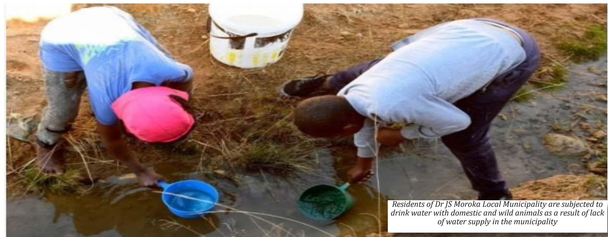
Residents of Dr JS Moroka Local Municipality are subjected to drink water with domestic and wild animals as a result of lack of water supply in the municipality