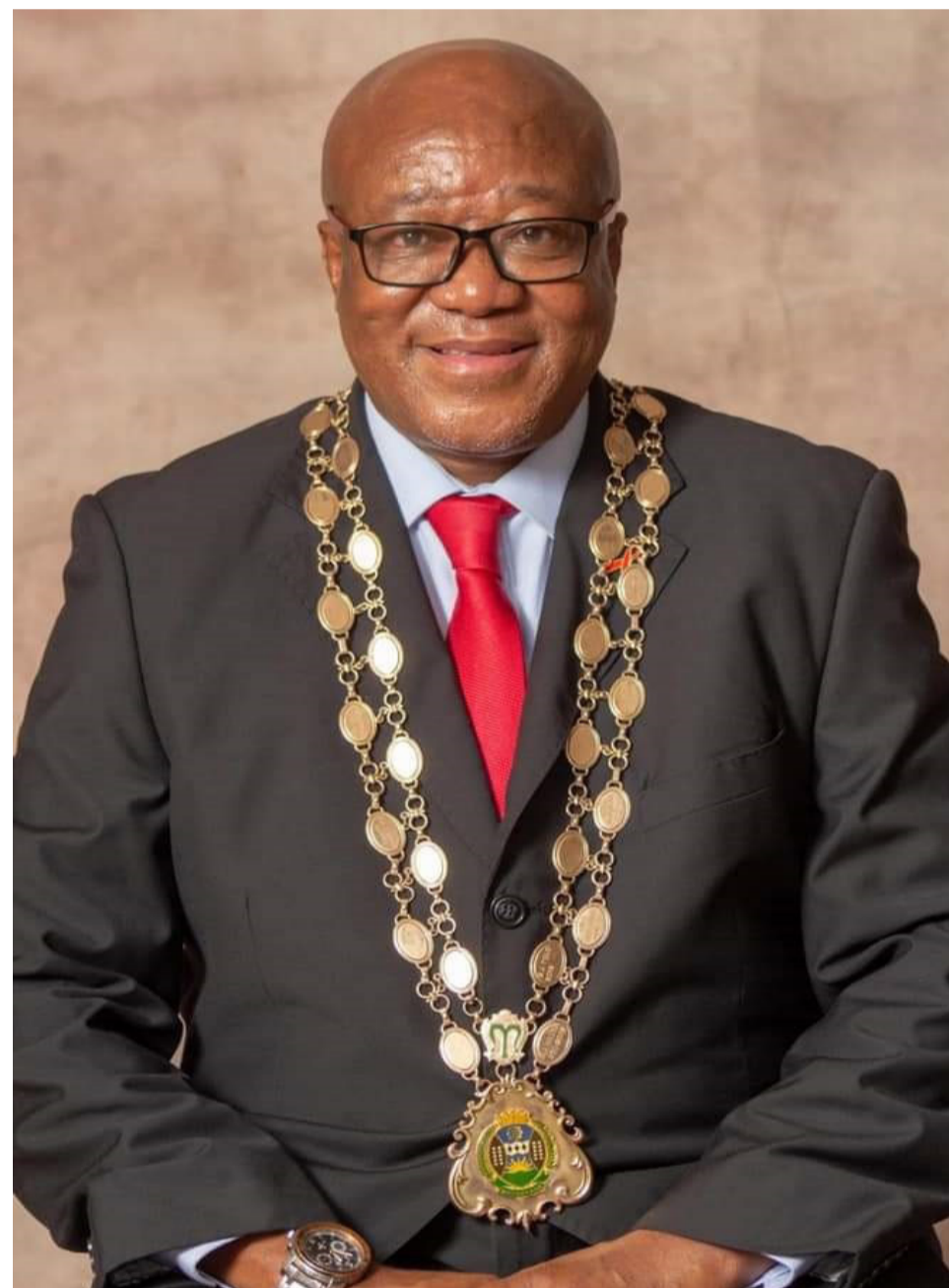
The newly inaugurated Executive Mayor of STLM, Cllr Diphala Motsepe, has vowed to serve all residents and accelerate service delivery