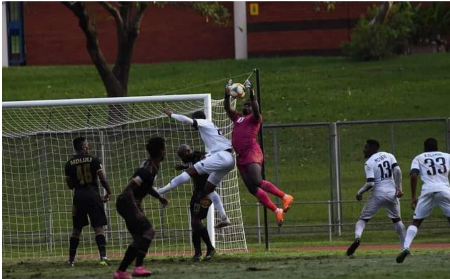
Sekhukhune United on the attack during their match with Royal AM at Chatsworth Stadium in Durban

A dominant display was shown by Babina Noko towards the end of the first half, forcing two saves by Royal AM outstanding goalkeeper who denied them goal scoring opportunity. In the second half Royal AM gave it all out and started dominating with hard tackles, shots and challenges on the ball that resulted in an unfortunate opportunity that hit the cross bars and go back into action. Towards the 70th minute, Babina Noko made substitutions to seal their defense as visitors could not show remorse and attacking