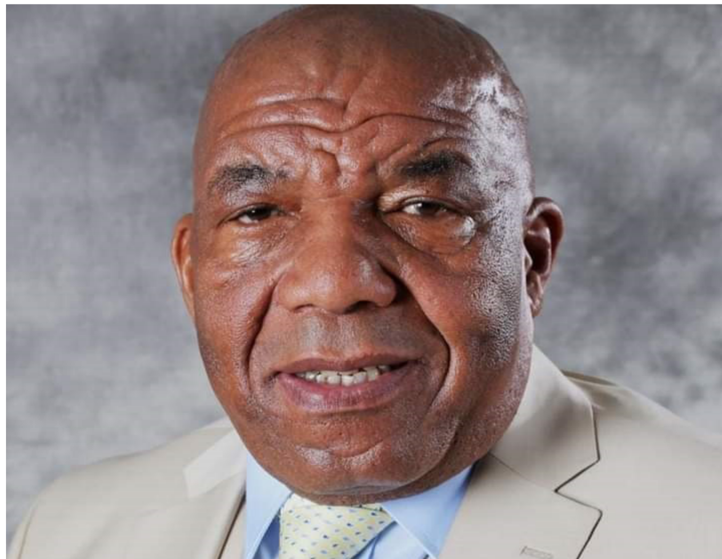
Vusi Shongwe, MEC for DCSSL in Mpumalanga, is happy about the decrease of roads fatalities in Mpumalange during Easter holidays