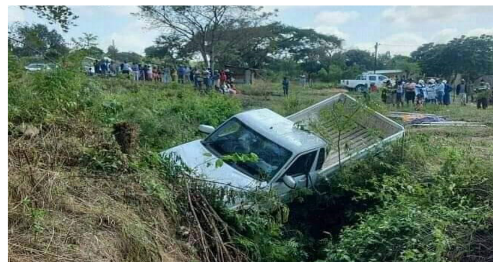
A LDV bakkie that overturned at Hazyview, killing three women and injured fourteen others

BY ERIC MATOME KGOMO HAZYVIEW: Three women were killed in a horror crash as bakkie overturns on R40 Road near Hazyview on Friday 2 April. Seventeen people were allegedly on board of the bakkie when the accident occurred. According to Department of Community Safety, Security and Liaison Spokesperson (DCSSL), Moteti Mmusi, The crash occurred when a Light Delivery Vehicle (LDV) overturned on R40 Road between Hazyview and Marite around 08h00. Mmusi said fourteen more people, who were also in the bakkie, sustained serious injuries and were rushed to Matikeane and Tintswalo Hospitals respectively," he said. "Two victims were declared dead at the scene while