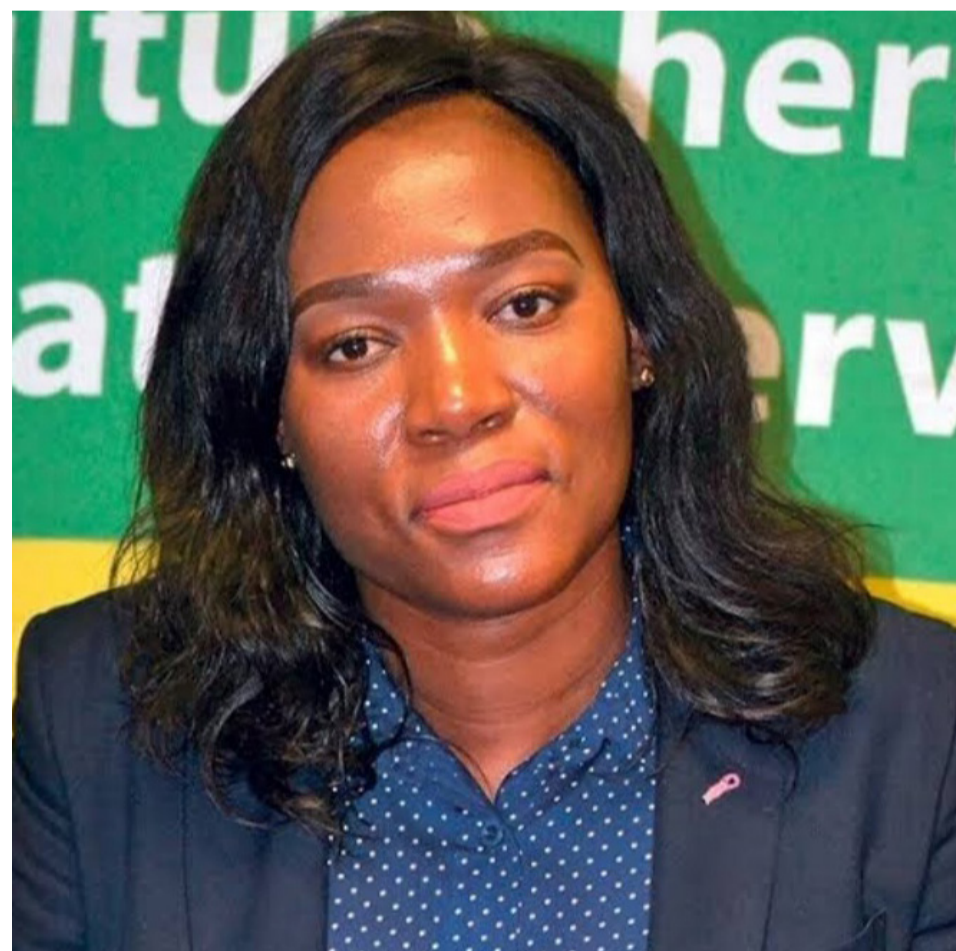
MEC for Sports, Arts and Culture in Limpopo has announced that she will be attending a media launch of Limpopo Sports Confederation Golf Day today in the afternoon