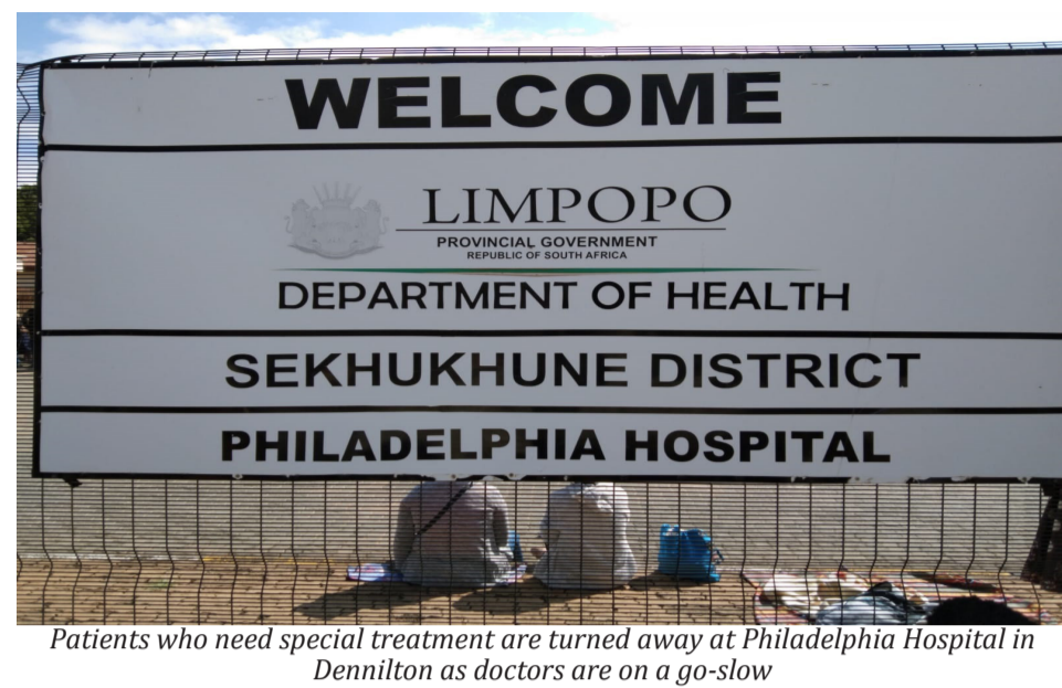
Patients who need special treatment are turned away at Philadelphia Hospital in Dennilton as doctors are on a go-slow