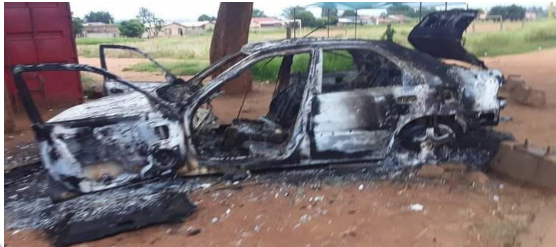
The remains of a vehicle that was burned by the community after shooting its owner at Barberton Hospital