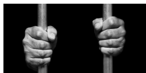
A 35 year old man has been sentenced to life imprisonment for raping his 10 year old niece

against him but the matter was reported to the police. The uncle went into hiding at one of his family members. However, his family sought justice and handed him over to the police. He was sentenced to life imprisonment for rape and his particulars will also be entered into the National Register for Sex Offenders. The court found him to be unfit to work with children and he will also be entered into the National Child Protection Register. Mpumalanga police management said they noticed with concern the moral decay in the society where adults entrusted with a responsibility to protect and care for children, molest them instead. The management further thanked the family for handing him over and applauded the work done by the Family Violence, Child Protection and Sexual Offenses Unit (FCS), the prosecution as well as the judiciary for their resilience in the case which saw the uncle getting a hefty sentence.