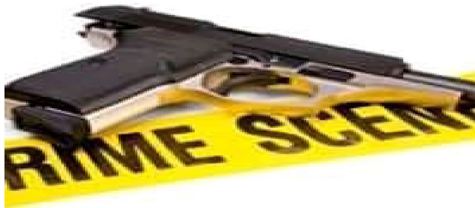
The IPID has taken over a crime scene at Moteti Village after a police constable stationed at Dennilton fatally wounding three people at a tavern

"According the information received thus far, the police constable from the Crime Intelligence Unit in Dennilton Police Station, received a tip off that certain people from Pretoria would be