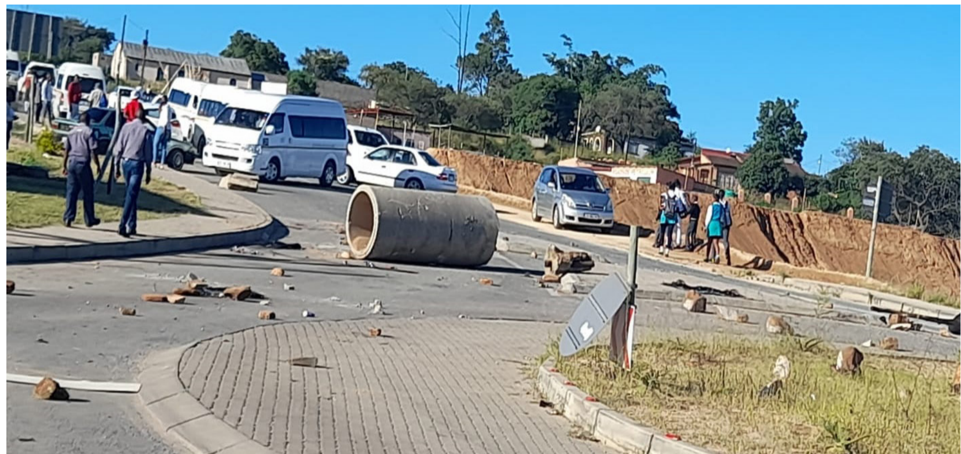
Residents of Masoyi blockade roads with different objects during a service delivery protest that saw a number of vehicles looted and torched