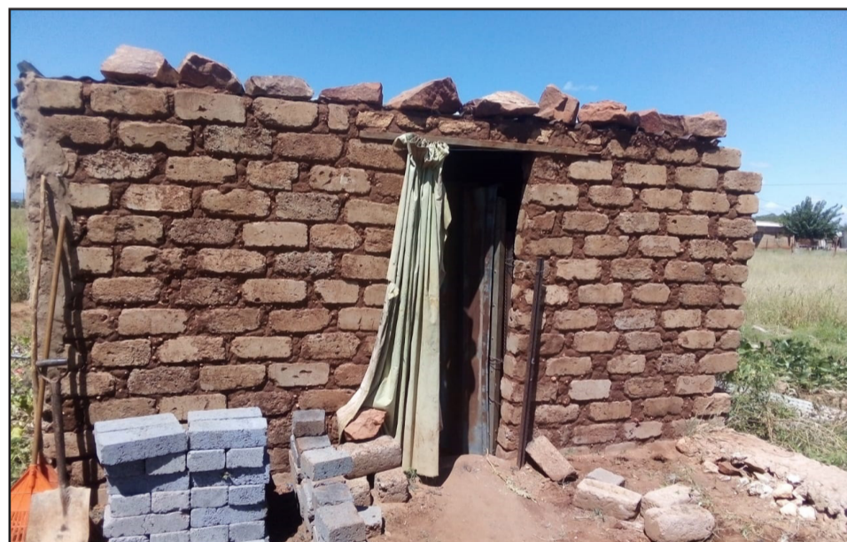
The house beneficiary, Mr Matjila, was living in an old dilapidating house before NDM and DSD donate a four room fully furnished house to him