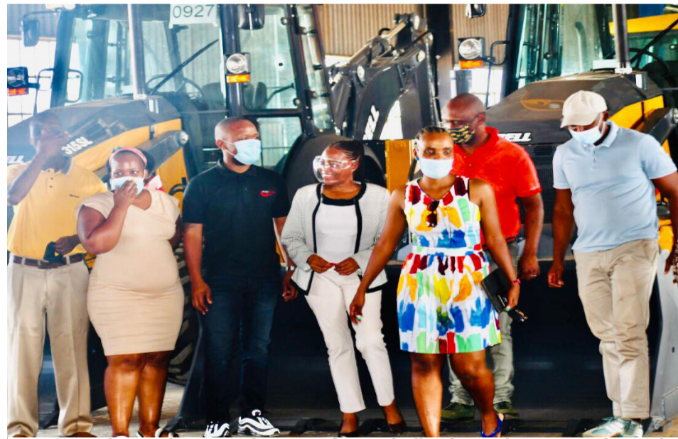
Dr JS Moroka Local Municipality councilors and officials standing next to the newly unveiled fleet that will be used to improve service delivery in the municipality