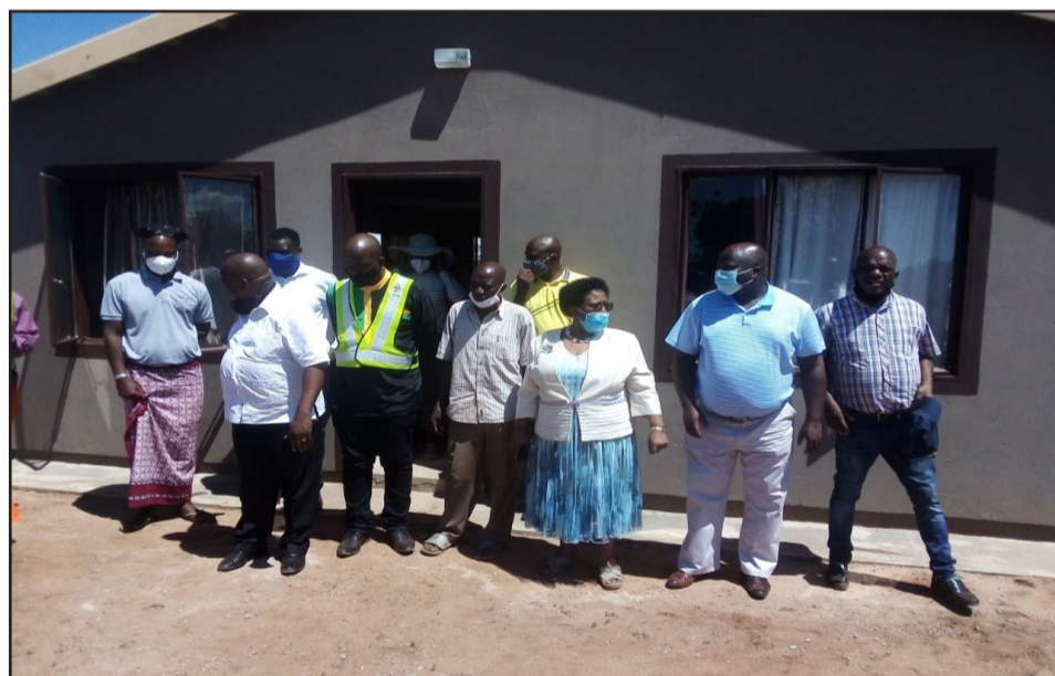
An entourage from NDM and DSD with the beneficiary during the official hand-over of the house at Katjibane Village