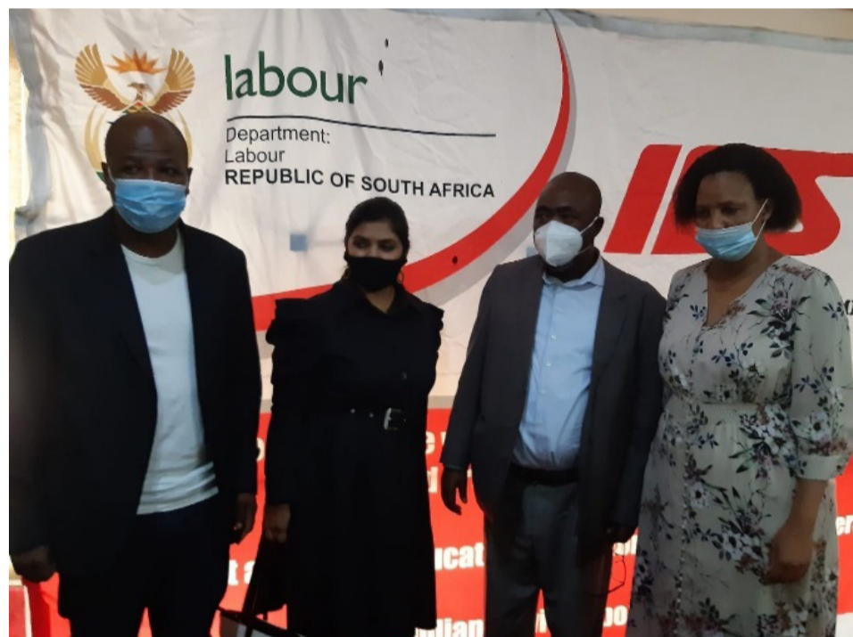
Truck drivers wants to be hired by big companies in Mpumalanga