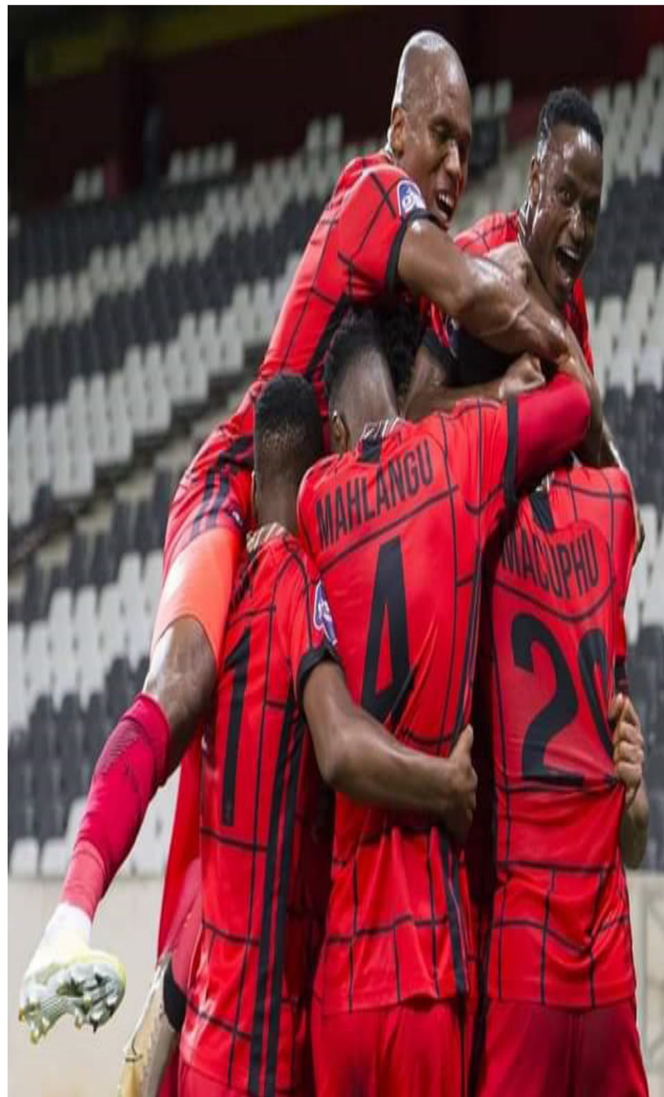
TS Galaxy FC is aiming to achieve a double when playing with Bloemfontein Celtic in their second round match at Dr Petros Molemela Stadium, on Sunday 4 April 2021