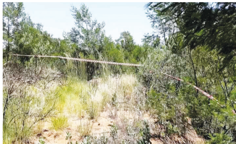
Witbank Police in search for murder suspects linked to the unidentified male body found thrown at Blesboklaage bushes in Emalahleni

The motive for the killing is still unknown. Anyone with information can contact the investigating officer Captain Dick Masango on 079 551 2708 or crime stop on 086001011.