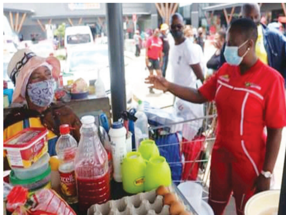
MEC for Health in Mpumalanga Province Sasekani Manzini paid homage to Steve Tshwete Local Municipality Covid-19 hotspots to monitor compliance

Over 59 000 Covid-19 cases were reported in Mpumalanga. More than 51 400 people recovered from the virus while over 6 700 people succumbed from Covid-19 complications. More than 1.4 Million tested positive for the virus in the country, with 1.2 Million recoveries and more than 41 000 people succumbed from the pandemic.