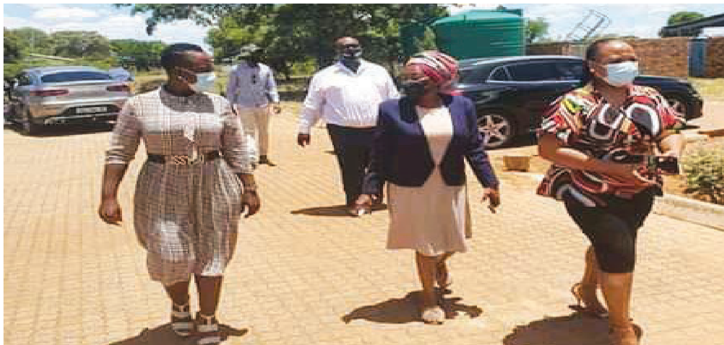
MEC for Department of Health in Mpumalanga, Sasekani Manzini (Left), during her visit at Mametlhake Hospital in Dr JS Moroka Local Municipality to get update on the progress made to curb the spread of Covid-19

MEC Manzini was happy with the availability of Oxygen and Personal Protective Equipment (PPE) in both health institutions. Manzini emphasized the importance of maintaining adequate PPE stock levels to enable healthcare workers to have uninterrupted access to the protective gear, required to perform their duties and for their personal safety at workplace. The MEC urged the staff, management and the community at large to continue to adhere to systems put in place to ensure compliance to Covid-19 precautionary measures, including the practice of social distancing, wearing of masks and washing of hands or sanitizing. She also encouraged the public to avoid gatherings or crowded places. The MEC further expressed gratitude to all frontline Health workers and management for their heroic self-