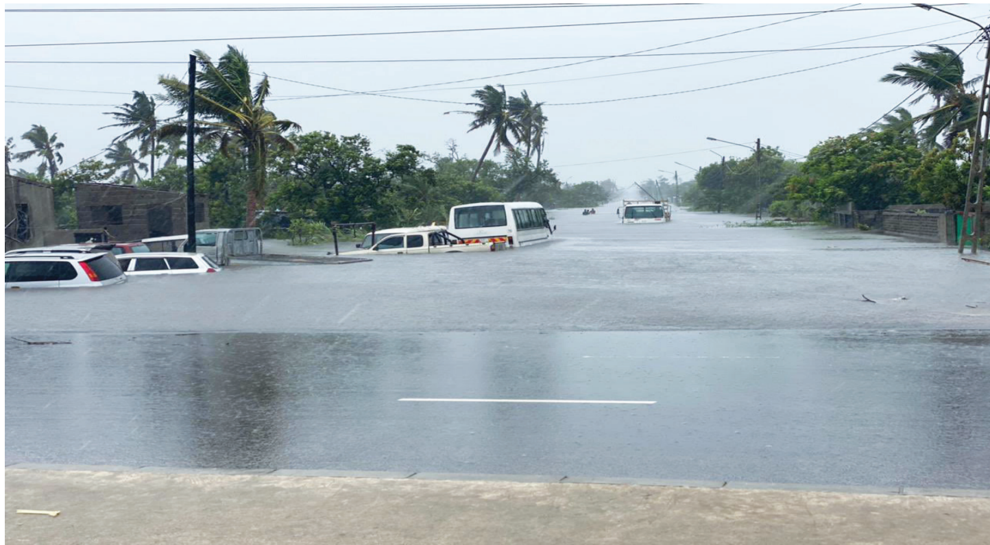
Tropical storm Eloise flooded roads and left other devastating effects after passing at some parts of Mpumalanga Province