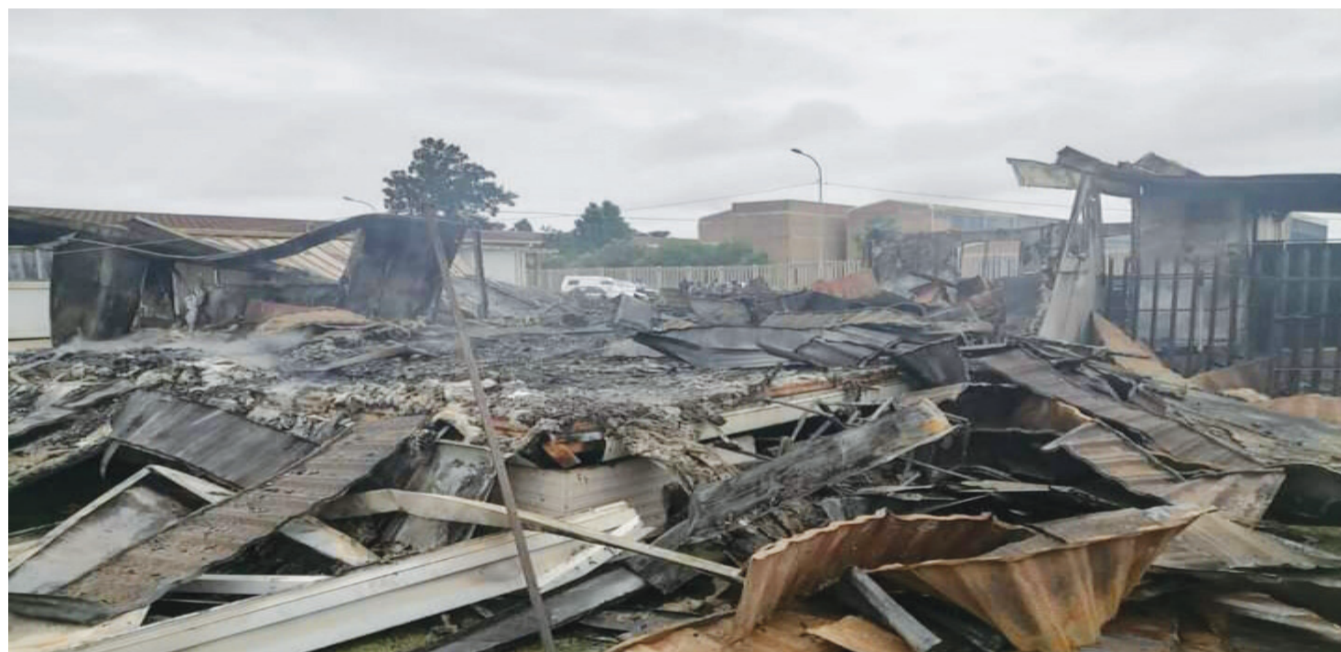
Police Still Investigating The Pending Case of a park home house that burnt to ashes