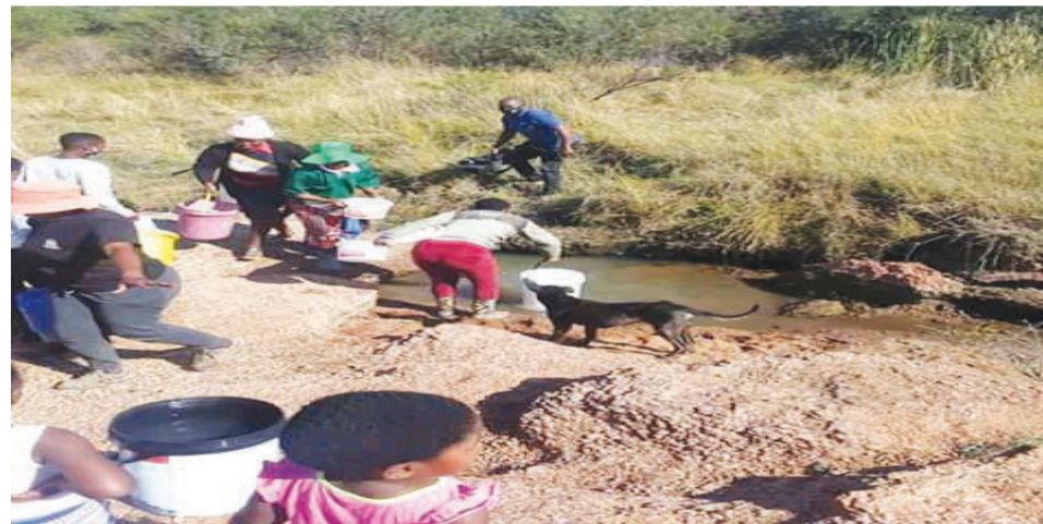
SAHRC report revealed that Thembisile Hani Local Municipality violates rights of residents to get basic services after communities draw drinking water from rivers and streams