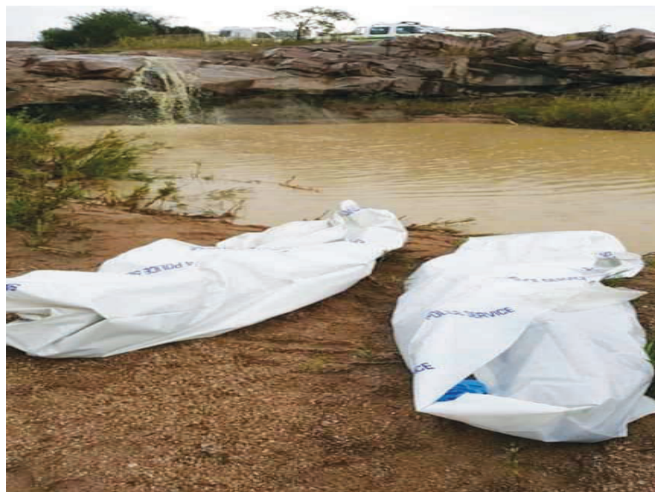
The police in Mpumalanga are sending a stern warning to residents to avoid crossing or performing rituals in flooding rivers following a number of drowning cases recently